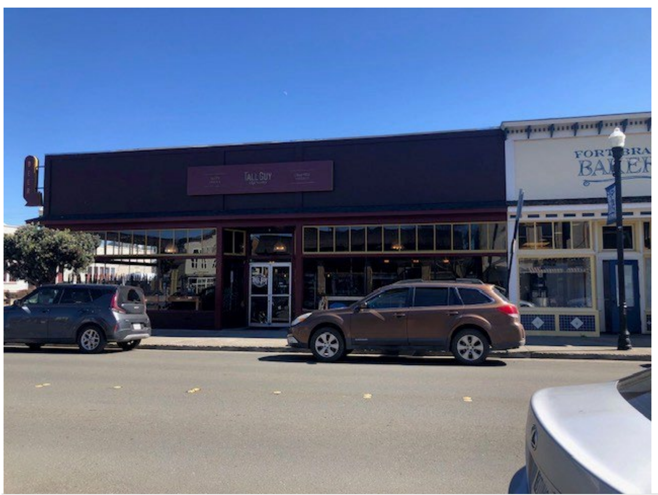
4 | P a g e