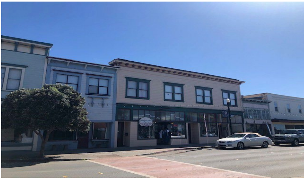
West side of Franklin Street