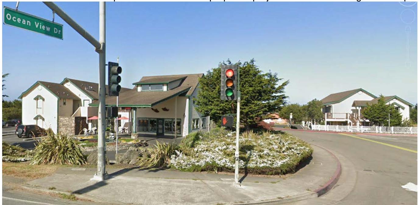
Image 1: Emerald Dolphin Motel Building A (right), Building B (left)

Appearance: Staff required the applicant to modify and revise the initial project design to better comply the Citywide Design Guidelines. Architectural features such as transom windows were added to the southern façade, awnings were included to create more articulation and the color palette changed from dark greys to earth-toned browns. In addition, a corner gable architectural element was removed because it made the building taller and landscaping was identified and further refined to improve the overall appearance. The Design Review Permit process gives the Planning Commission an opportunity to further evaluate the proposed design and, if desired, to further modify the design in order to ensure the appearance does not detract from the economic vitality of established commercial businesses. Design Review is discussed in detail further in the staff report. The following images represent the appearance of established commercial businesses in the area to provide context of the proposed project within the existing streetscape.