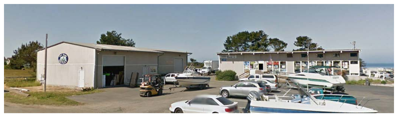
Image 2 : Fort Bragg Outlet Building A (right) and Building B (left)