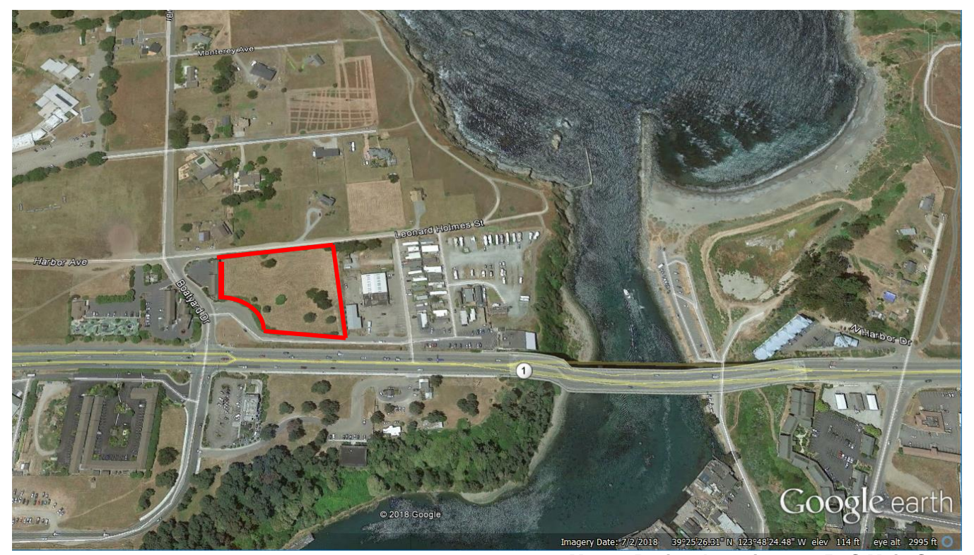
Map 1: Project Location - 1151 S Main Street

The applicant is seeking a Coastal Development Permit, Design Review and Minor Subdivision to create two parcels and construct a 7,500 SF AutoZone retail store. The retail store would include a 26-space parking lot, roadway improvements to the unnamed frontage road, pedestrian improvements, a bio retention pond, landscaping and signage. The minor-subdivision would create two lots from an existing 2.5-acre parcel; Lot 1 on the northern portion of the site would be the location of proposed AutoZone retail store; no development is proposed for the southernmost lot (Lot 2) at this time (Attachment 2 – Site Plan).