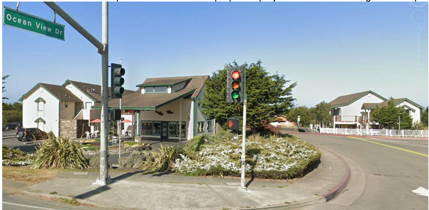
Image 1: Emerald Dolphin Motel Building A (right), Building B (left)

Appearance: Staff required the applicant to modify and revise the initial project design to better comply the Citywide Design Guidelines. Architectural features such as transom windows were added to the southern façade, awnings were included to create more articulation and the color palette changed from dark greys to earth-toned browns. In addition, a corner gable architectural element was removed because it made the building taller and landscaping was identified and further refined to improve the overall appearance. The Design Review Permit process gives the Planning Commission an opportunity to further evaluate the proposed design and, if desired, to further modify the design in order to ensure the appearance does not detract from the economic vitality of established commercial businesses. Design Review is discussed in detail further in the staff report. The following images represent the appearance of established commercial businesses in the area to provide context of the proposed project within the existing streetscape.