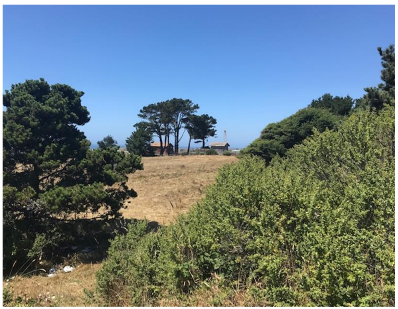
Image 6: Perspective of view easement across lot from unnamed frontage road

In order to approve a Coastal Development Permit (CDP) for a project that is located "along Highway 20 and Highway 1 on sites with views to the ocean" CLUDC 17.50.070 requires the review authority to find that the proposed project: