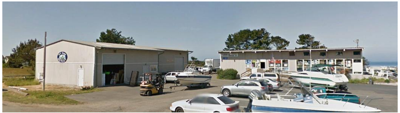
Image 2 : Fort Bragg Outlet Building A (right) and Building B (left)