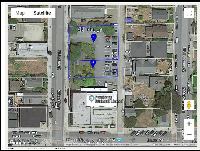
Pros and cons: small area, has water, is currently planted and would require removal of decorative landscaping.