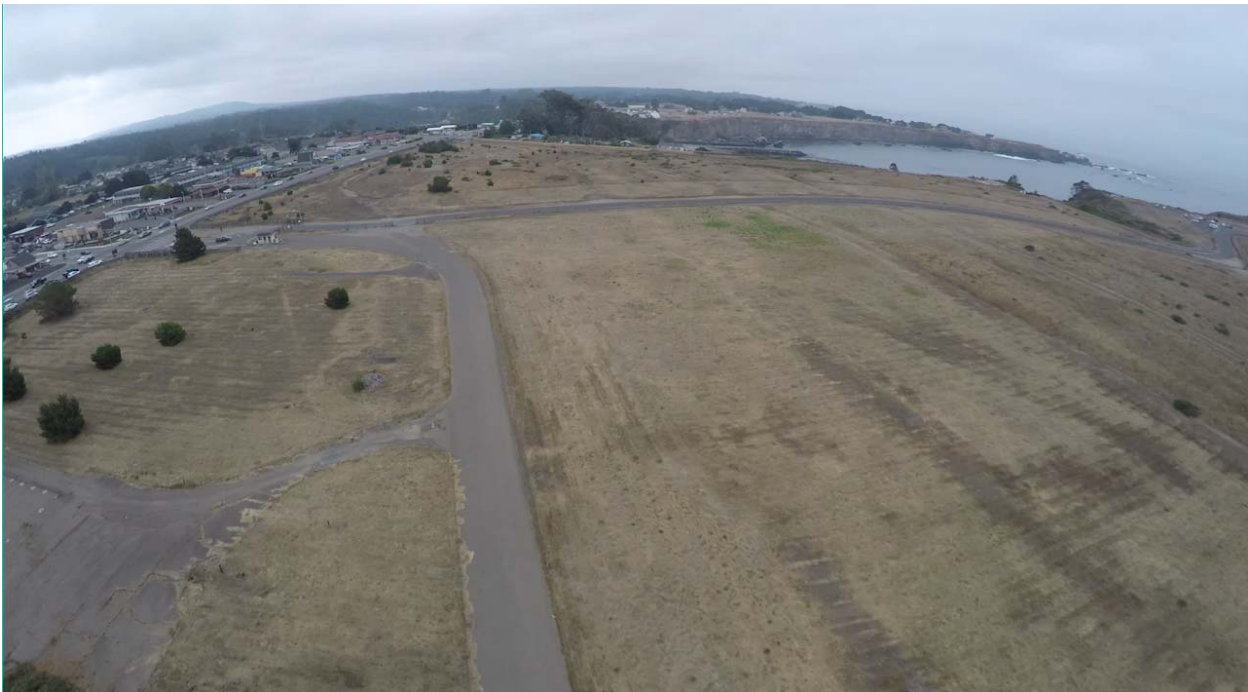
Looking south towards Cypress Street entrance.