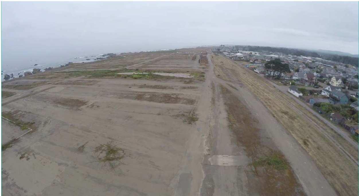
Looking north from about the Pine Street area.