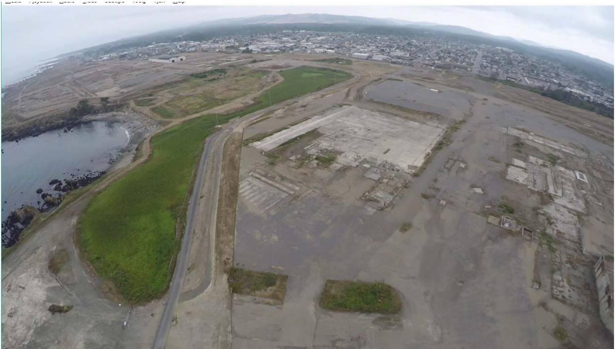
Looking north-east toward the Mill Pond from the Waste Water Treatment Facility