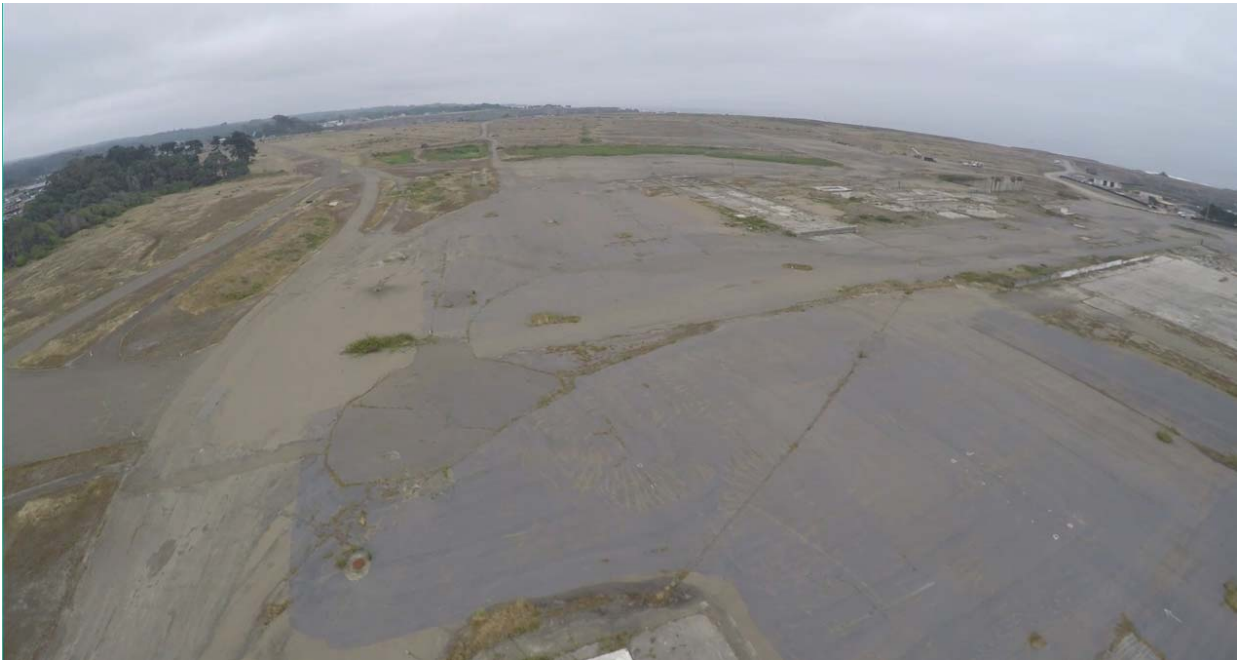
Looking south from about Oak Street