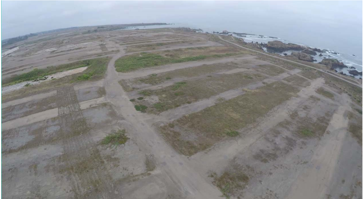
Looking south from northern boundary of Mill Site.