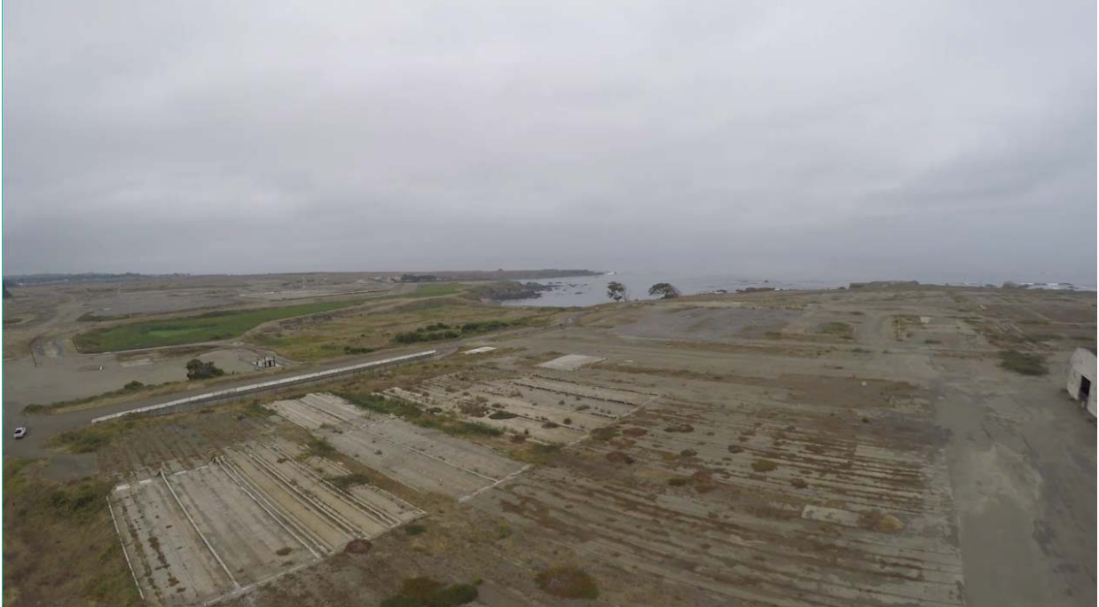
Looking south-west from about the Redwood Street area