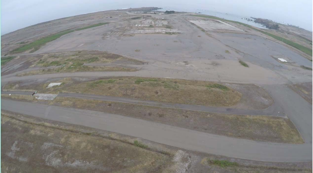
Looking west from about Oak Street