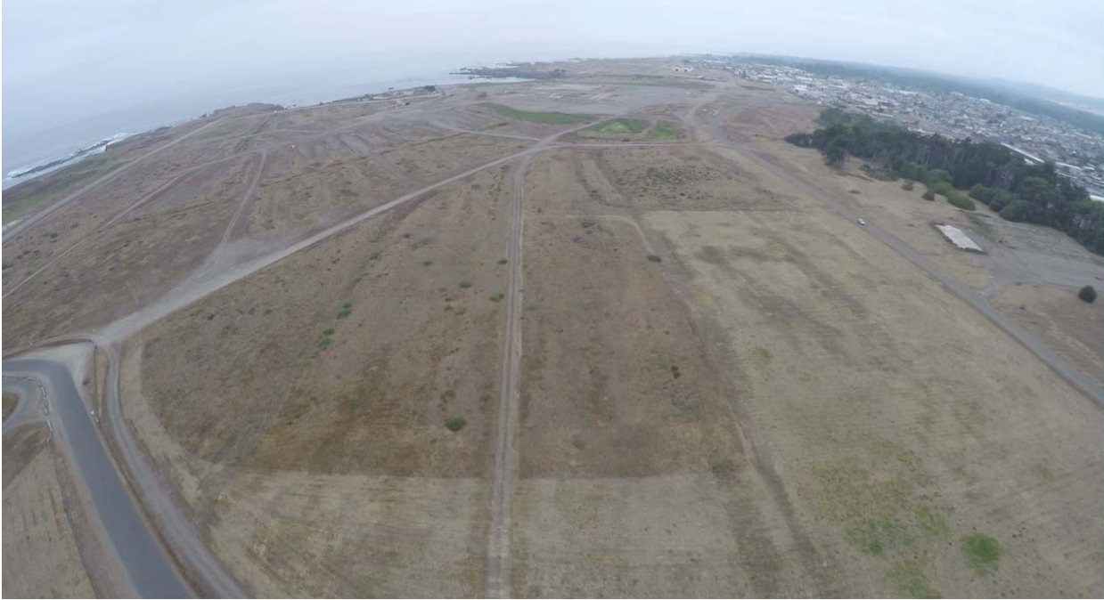
Looking north towards the entire site, from area of Cypress Street.