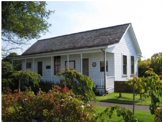
Old Fort Building, 430 North Franklin Street

will ensure that the attractiveness of the downtown will be preserved and enhanced. Increasing pedestrian activity, improving street lighting, parking, and amenities, and ensuring that renovations and new construction maintain the historic scale and character of this area will foster the continued vitality of the CBD.