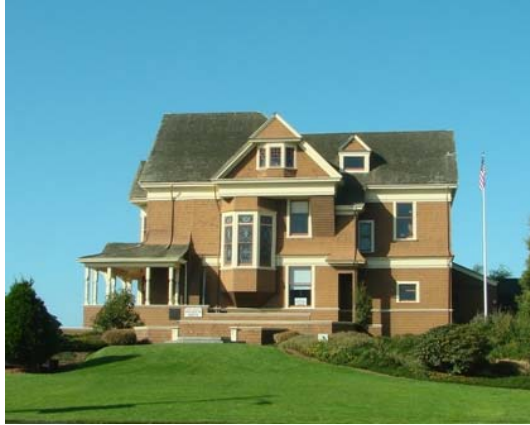
Guest House Museum, Main Street