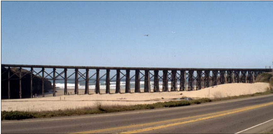
Trestle at Pudding Creek: A historically significant structure at MacKerricher State Park

Policy CD-7.1 Protect and Preserve Buildings and Sites with Historic and Cultural Significance to the Community.