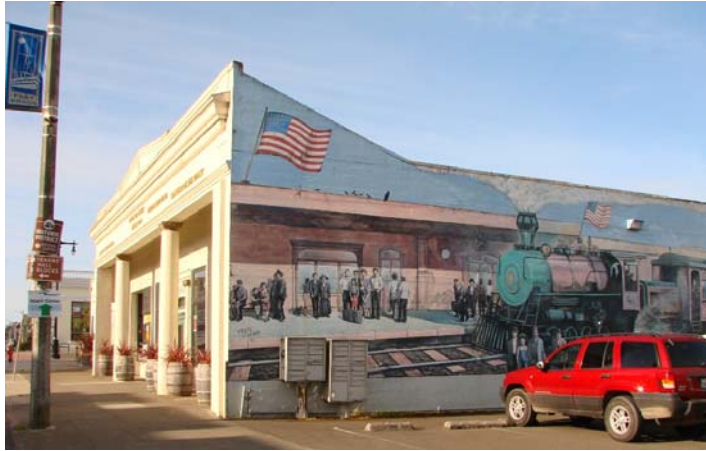
Mural at Company Store

Policy CD-8.2 Provide Public Open Spaces : Encourage the development of public open spaces for gatherings and fairs in commercial areas of the City.