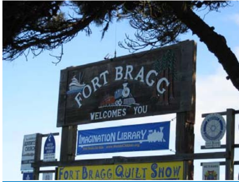
Fort Bragg Gateway Welcome Sign

Policy CD-5.1 Parking Location : Wherever feasible, locate parking facilities to the rear of the development so that the building facade is contiguous with the street frontage, and parking areas are hidden from the street.