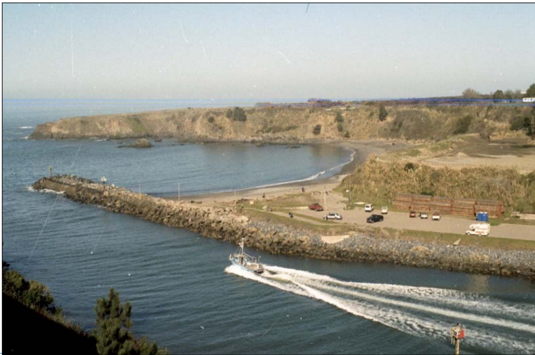
Oceanfront Park and entrance to Noyo Harbor

Program CD-4.1: Maintain, distinctive signs placed in a landscaped area at the south entryway at Highway 20/Highway One and at the north entryway on Highway One at the City Limits.