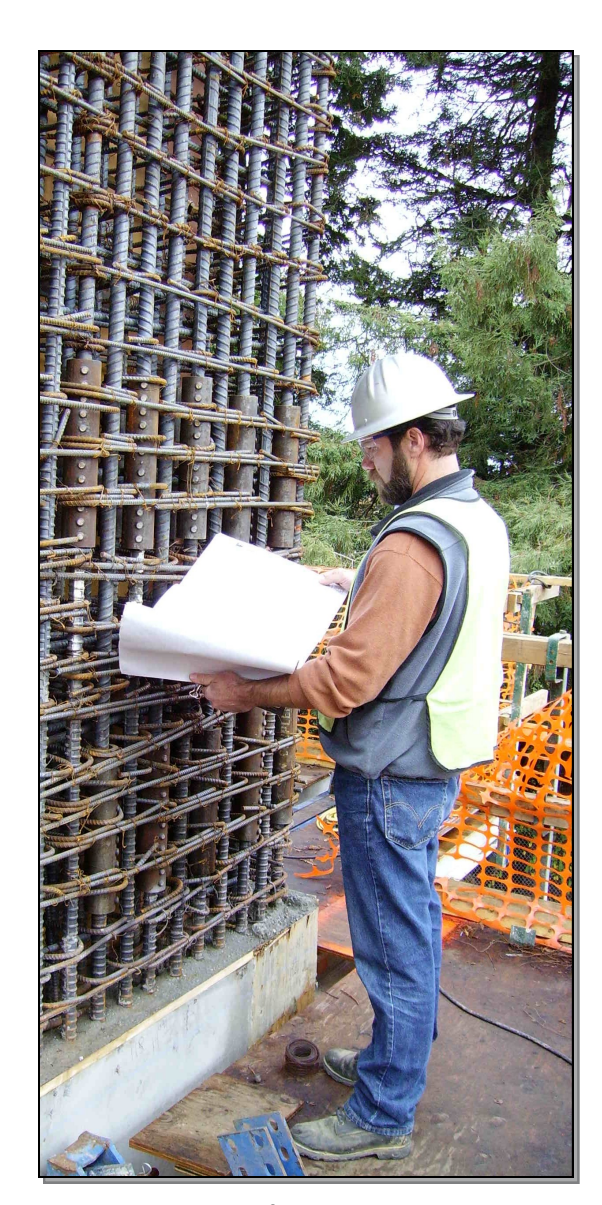
SHN inspector verifying rebar placement and dimensions to assure consistence with project plans.

Although the project's environmental permitting is completed, we are prepared for unforeseen environmental issues through our familiarity with applicable regulations and guidelines, regulatory staff, and successful mitigations measures. SHN's in-house environmental planning and permitting staff is available for quick consultation, so that construction schedules are impacted as little as possible. We will verify compliance with environmental permitting and mitigation measures in accordance with the requirements of the applicable documents and regulatory permits. We will rely on our good reputation with local environmental regulators to troubleshoot any issues that may arise during construction. Having a readily accessible environmental planning and permitting department is another way we prepare for a smooth and uneventful construction management project.