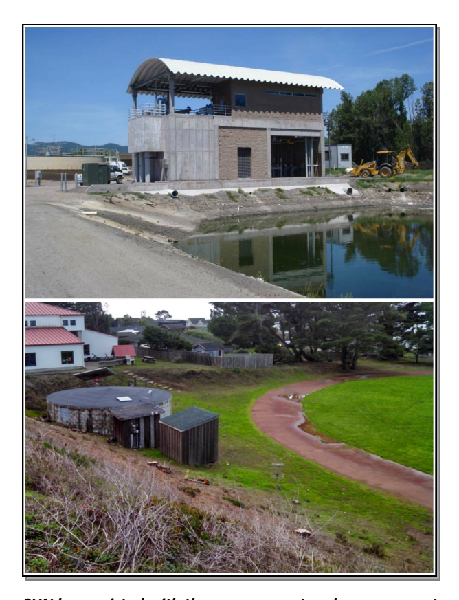
SHN has assisted with the procurement and management of funding for several USDA-RD-funded projects, including projects for the City of Willits and the Mendocino City CSD.

Excellent construction management depends on the ability to limit unforeseen circumstances, and to respond to them quickly and efficiently by being prepared. SHN will limit unforeseen circumstances by relying on our construction management experience of projects of similar size and scope, with prepared staff who have many years of construction management and inspections experience. We will utilize our existing WWTP Upgrade Project administrative documentation structure and distribution channels that comply with all construction and contract administration requirements.