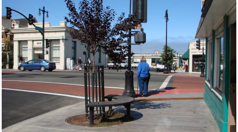
New Streetscape in Downtown Fort Bragg

Policy CD-3.3 Economic Vitality : Continue to support the economic diversity and vitality of downtown businesses.