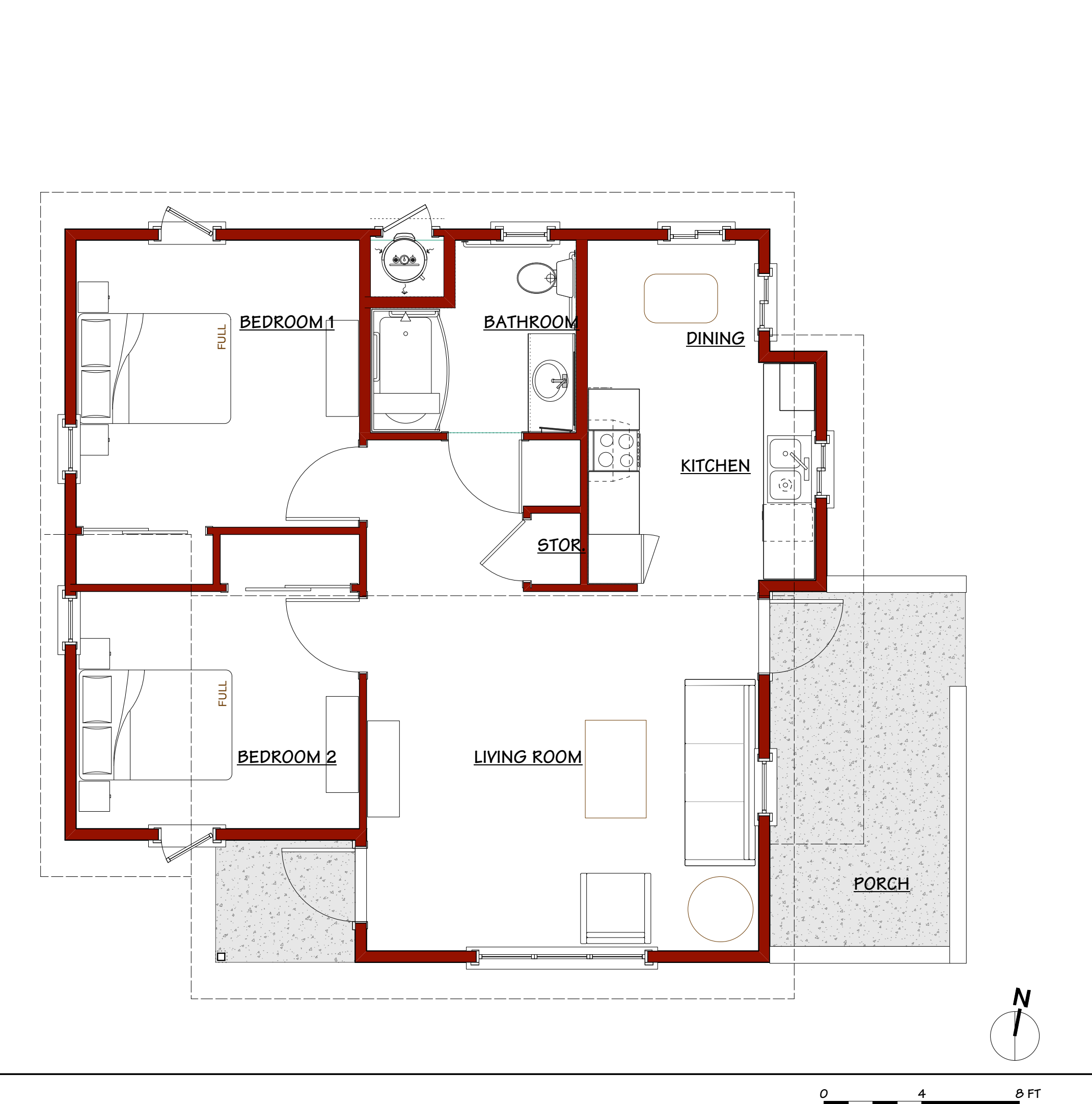
UFAS UNIT - TWO BEDROOM (830 S.F.) Scale: 1/4" = 1'-0"