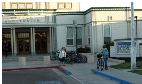
Bicycle use at school

Program C-10.1.5: Maintain bikeways to ensure that they are free of debris and other obstacles. Consider increasing the number of trash receptacles, solar-powered emergency telephones, and increased lighting along bicycle trails.