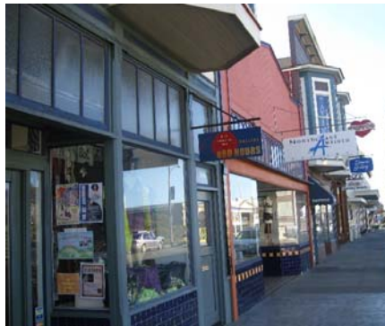
South Main Street

Transportation improvements to Main Street and principal streets in the Central Business District will enhance the character, sense of place and economic well-being of this area. However, the need to accommodate traffic flow through the City should be considered in the context of the community's desire to preserve and enhance the historic character of Fort Bragg's Central Business District.