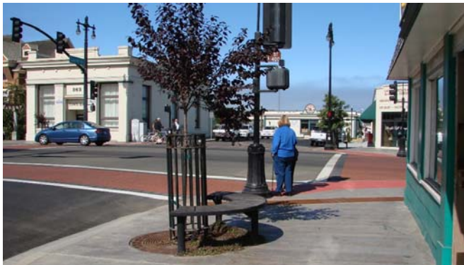
Complete streets in Central Business District

Program C-1.2.3.3: Walking and bicycling shall be integrated into the city's circulation network and included in all new projects.