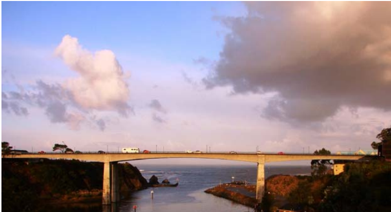
Noyo River Bridge