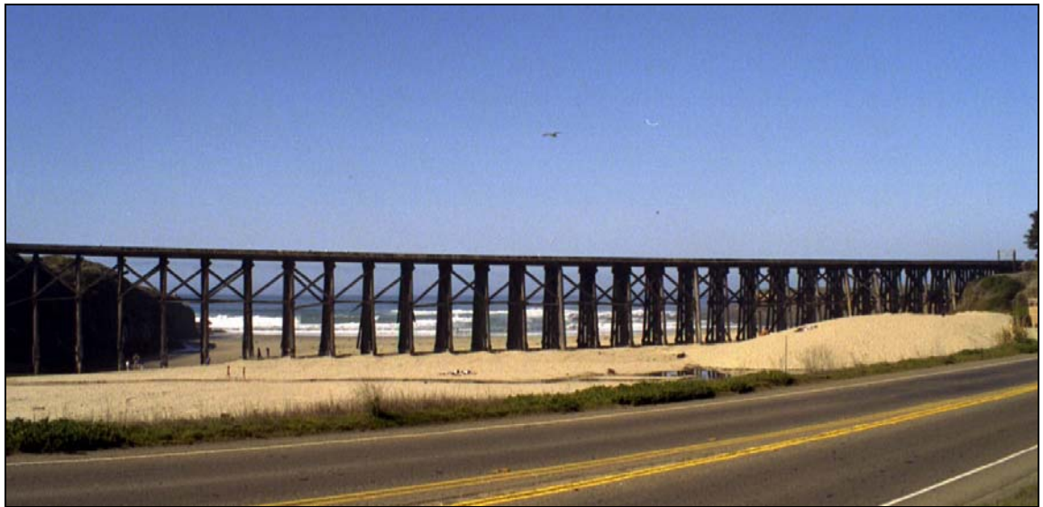
Trestle at Pudding Creek: A historically significant structure at MacKerricher State Park

Policy CD-7.1 Protect and Preserve Buildings and Sites with Historic and Cultural Significance to the Community.