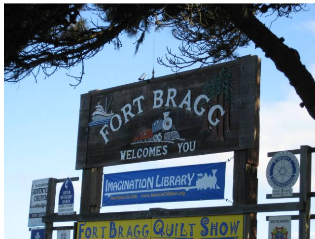
Fort Bragg Gateway Welcome Sign