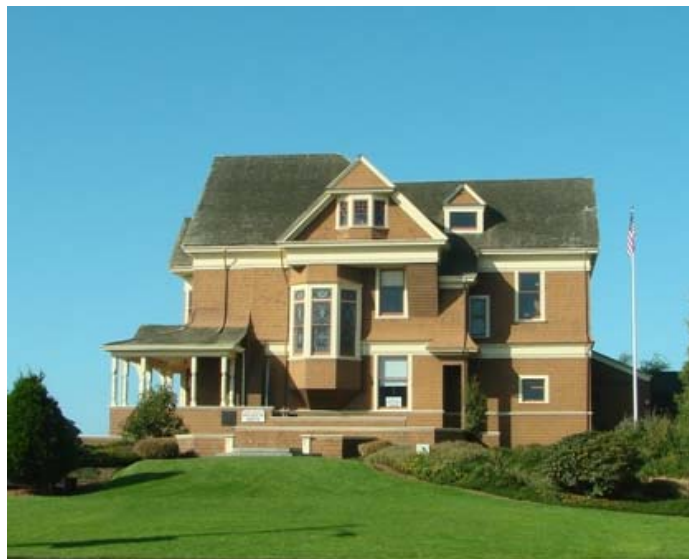
Guest House Museum, Main Street

Program CD-7.3.3: Support the activities of the Fort Bragg-Mendocino Coast Historical Society.