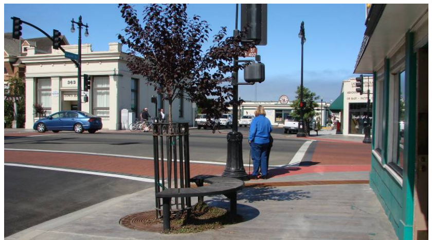
New Streetscape in Downtown Fort Bragg

Policy CD-3.3 Economic Vitality : Continue to support the economic diversity and vitality of downtown businesses.