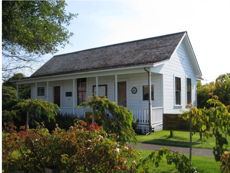
Old Fort Building, 430 North Franklin Street