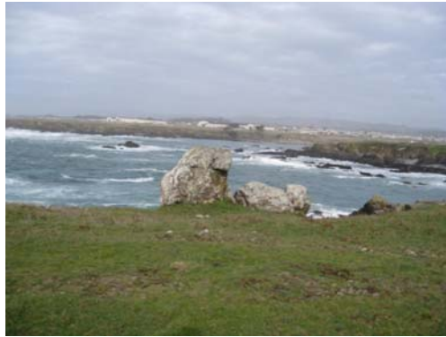
Noyo Headland Park