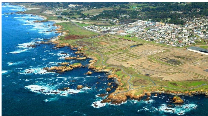
Noyo Headlands Park – California Coastal Trail

Program OS-16.2147.1: Ensure that City trails connect with the California Coastal Trails system, as shown on Map OS-3. Acquire rights-of-way through Offers to Dedicate; easements; land transfers; and land acquisition, as appropriate.