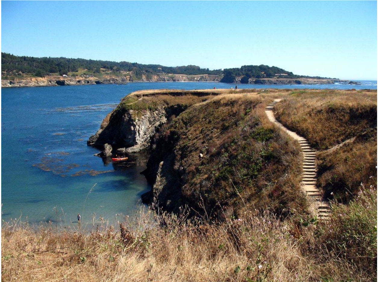
Dirt stair trail with redwood boards and rebar supports