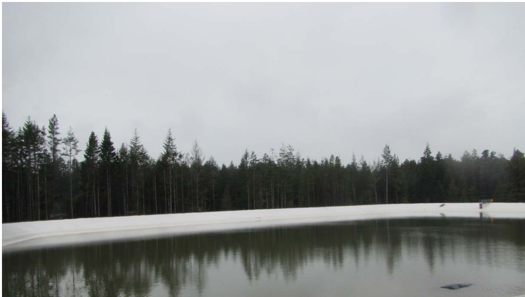
Figure 1: Summers Lane Reservoir

During Fiscal Year 2016-2017, the City completed the Summers Lane Reservoir Project providing an additional 15 million gallons (MG) of raw water storage to help ensure a reliable water supply during the late summer months when flows are low at the City's three water sources (Fort Bragg, May 2017). In addition, this new raw water storage will ensure adequate water supply during severe drought years and will help to meet the needs of future development for the City.