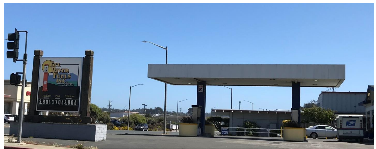
Eel River Fuels has the only canopy that does not have a logo or company name on its canopy.