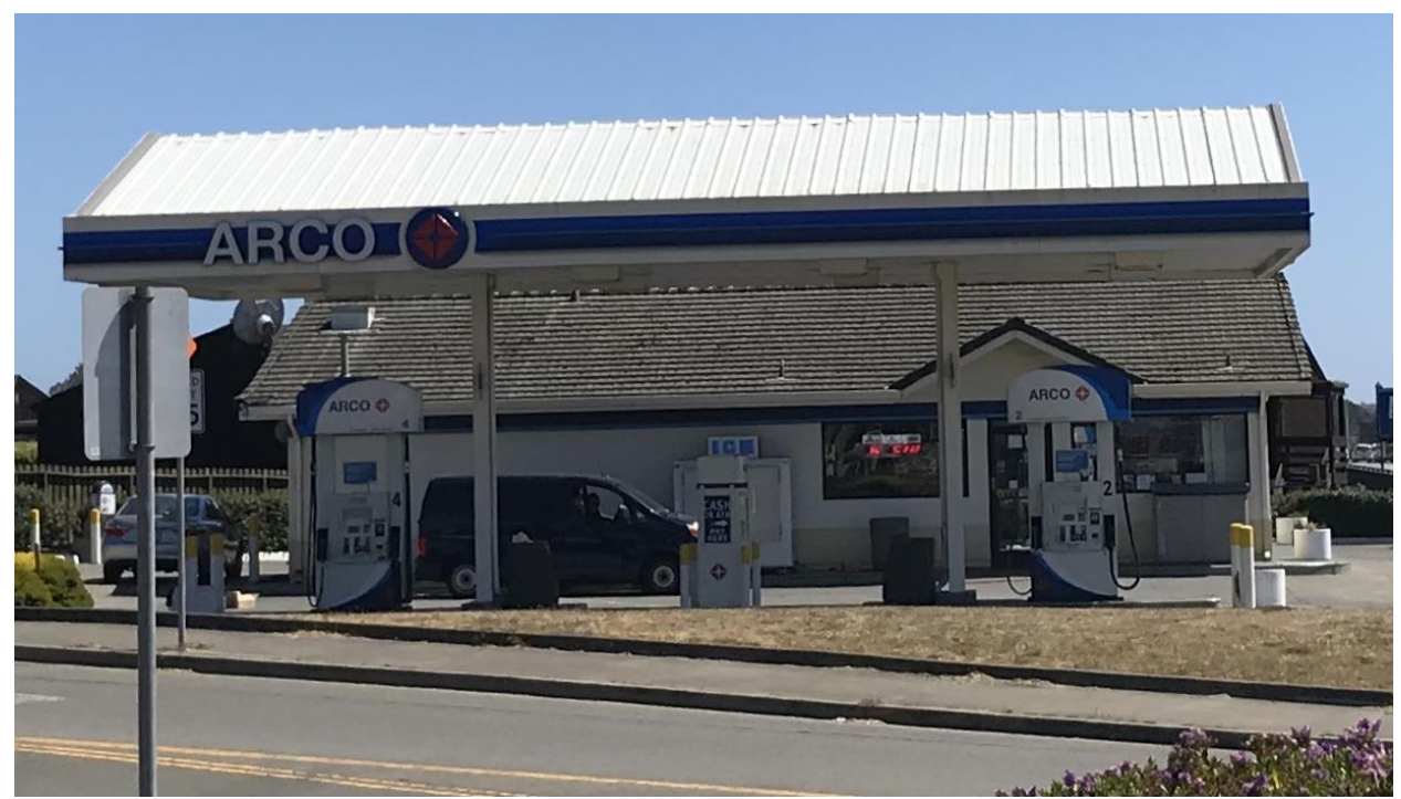
Arco has an internally illuminated logo and company name