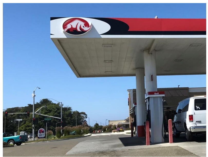
Red Rhino has an internally illuminated logo