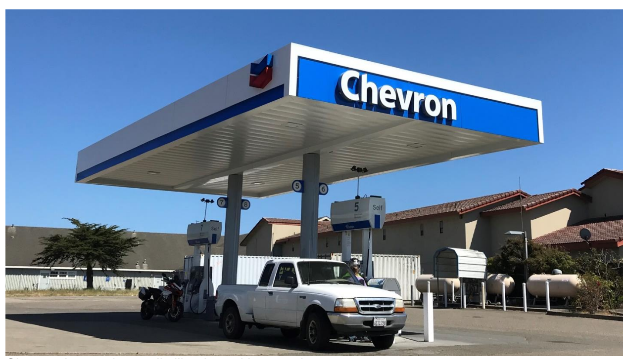
Chevron has an internally illuminated logo and company name