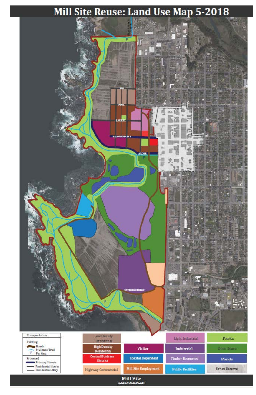
FIGURE 2-2 MILL SITE REUSE LAND USE MAP