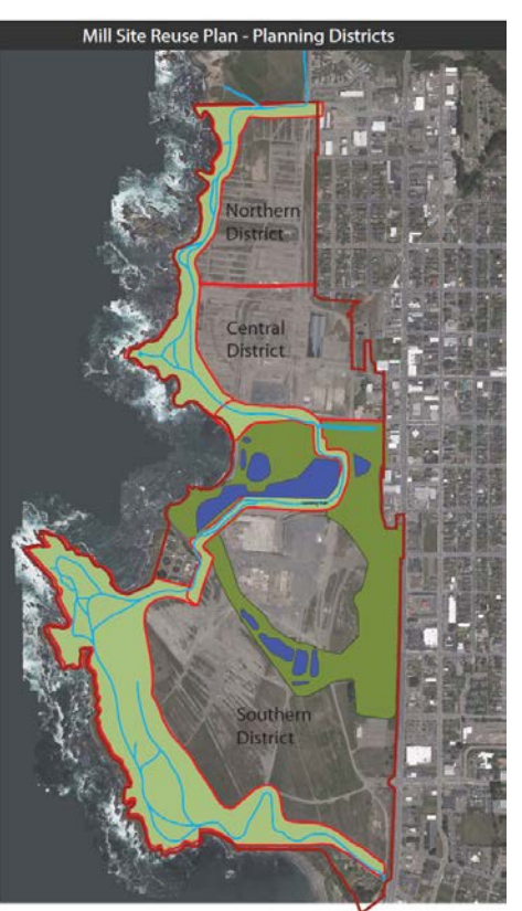
FIGURE 2-1 DISTRICT MAP

The Central area will include commercial, visitorserving, light industrial/live-work, and higher-density residential uses. A resort, conference facility, and other visitor-serving uses will be located along the coast. The extension of Redwood Avenue will connect the downtown, resort, light industry area, community park, and the coastline. The community park will accommodate a farmers' market and other community events, thereby anchoring activity in this district.