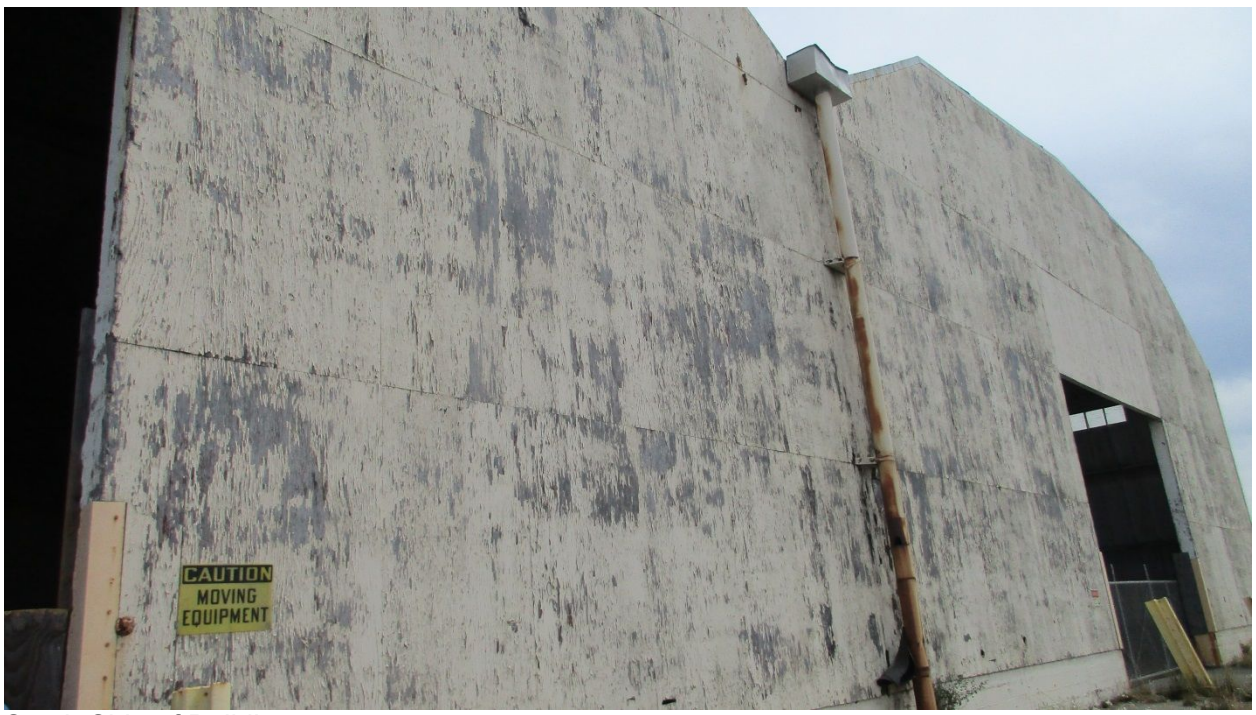
South Side of Building