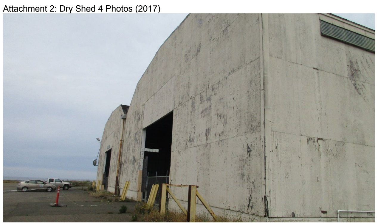
South east Corner