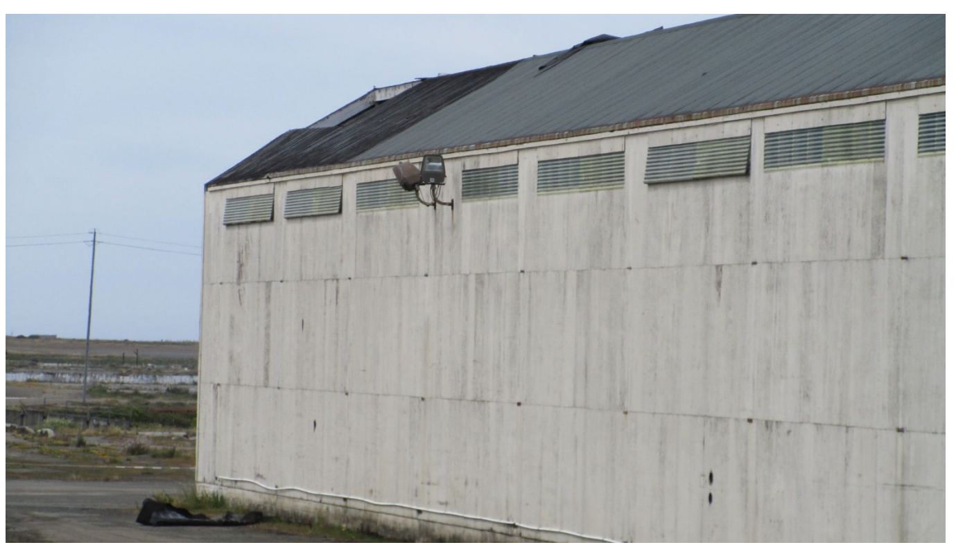
Hole in roof Southwest