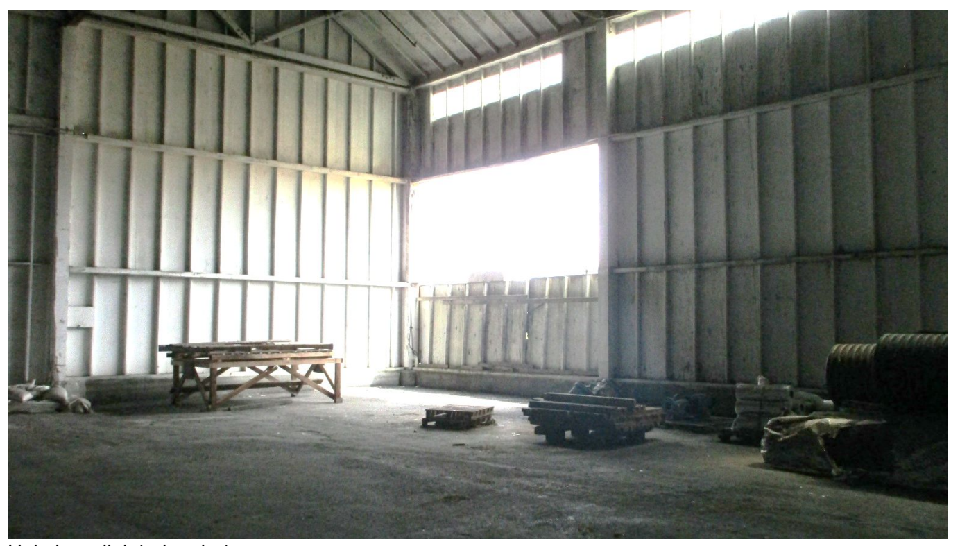
Hole in wall, interior shot