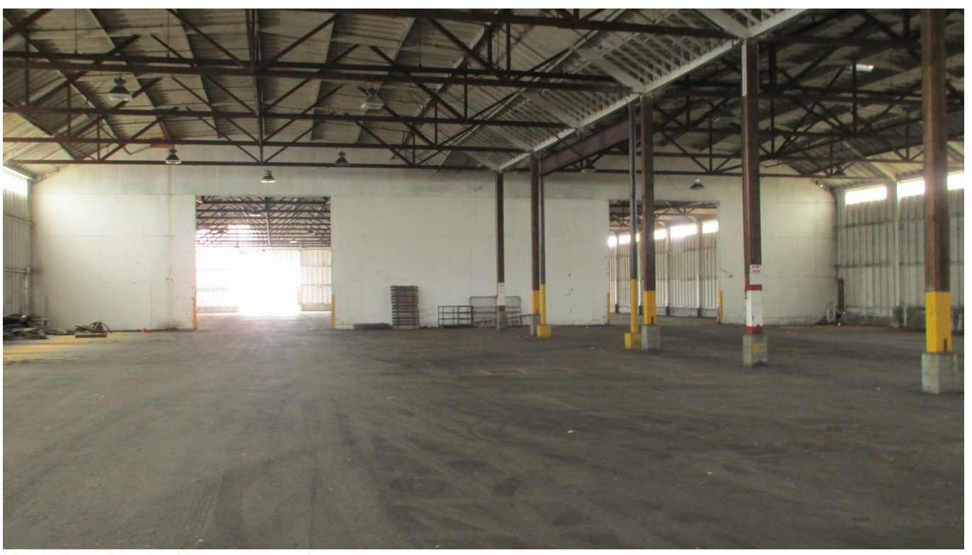
North East Bay looking south and west