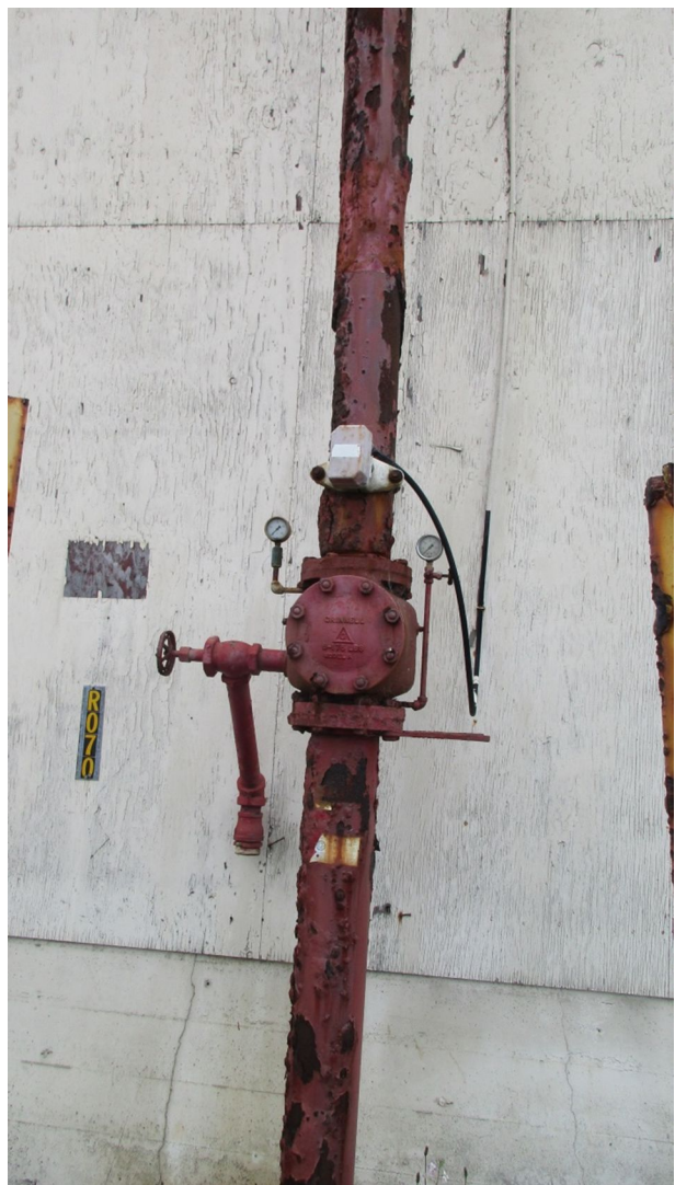
Deteriorated sprinkler main