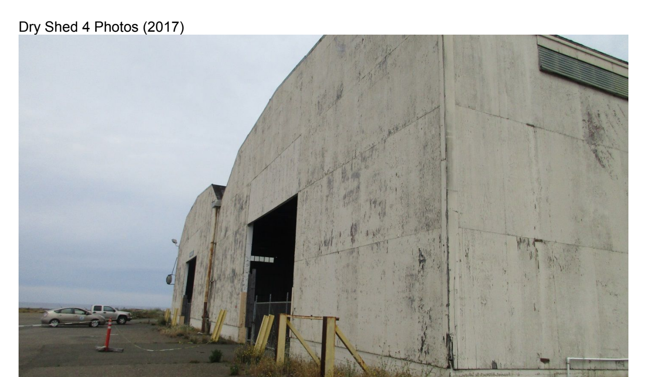
South east Corner