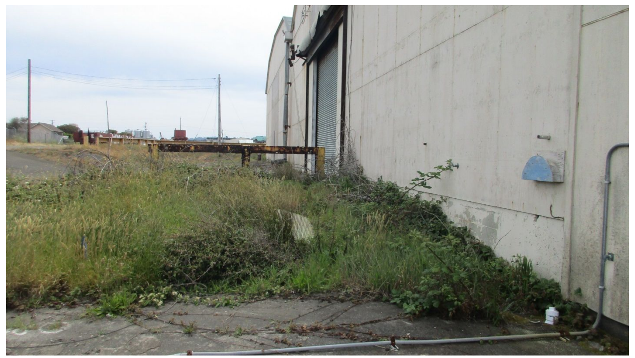
North Side of Building