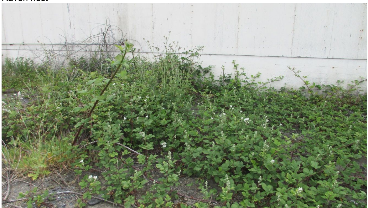
Typical vegetation surrounding shed