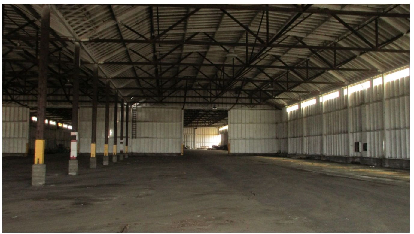
South east bay looking north, illustrates wall framing/CMU, roof structural system and asphalt floors