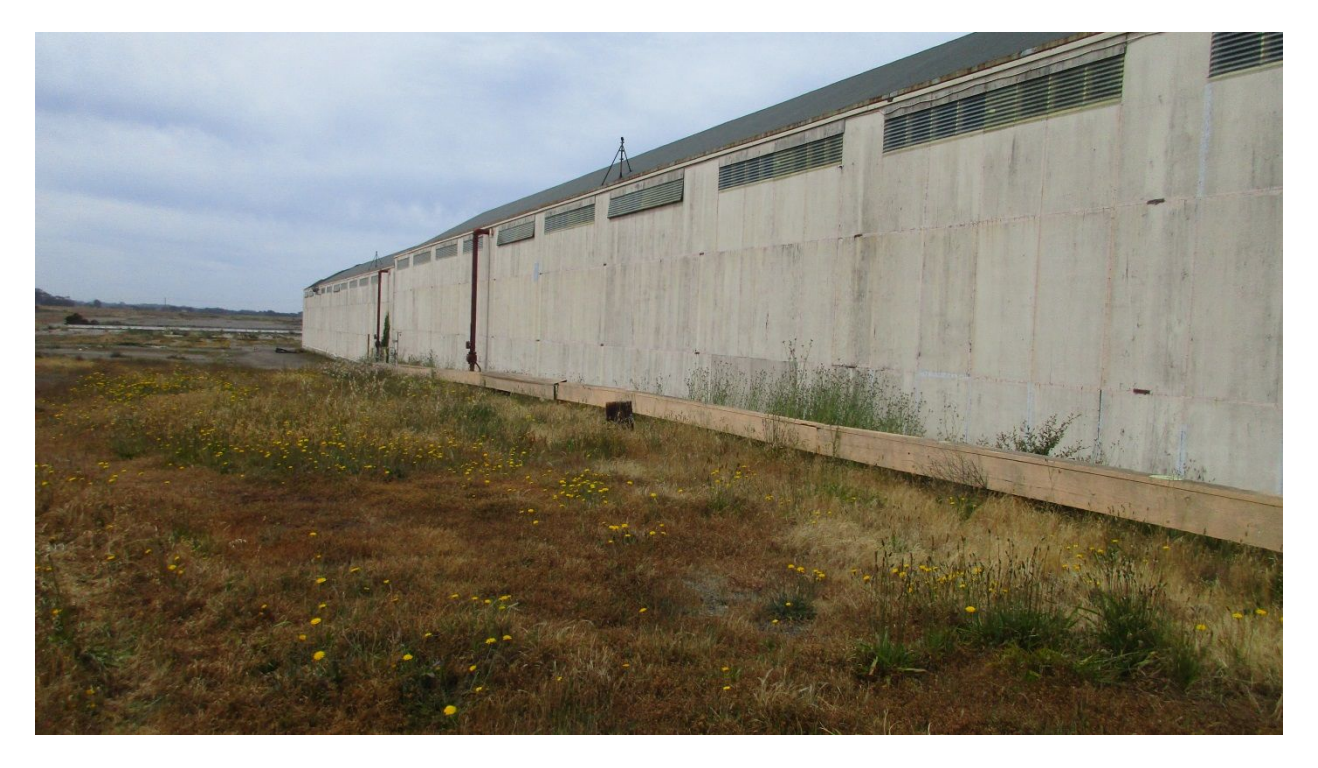
East Side of Building