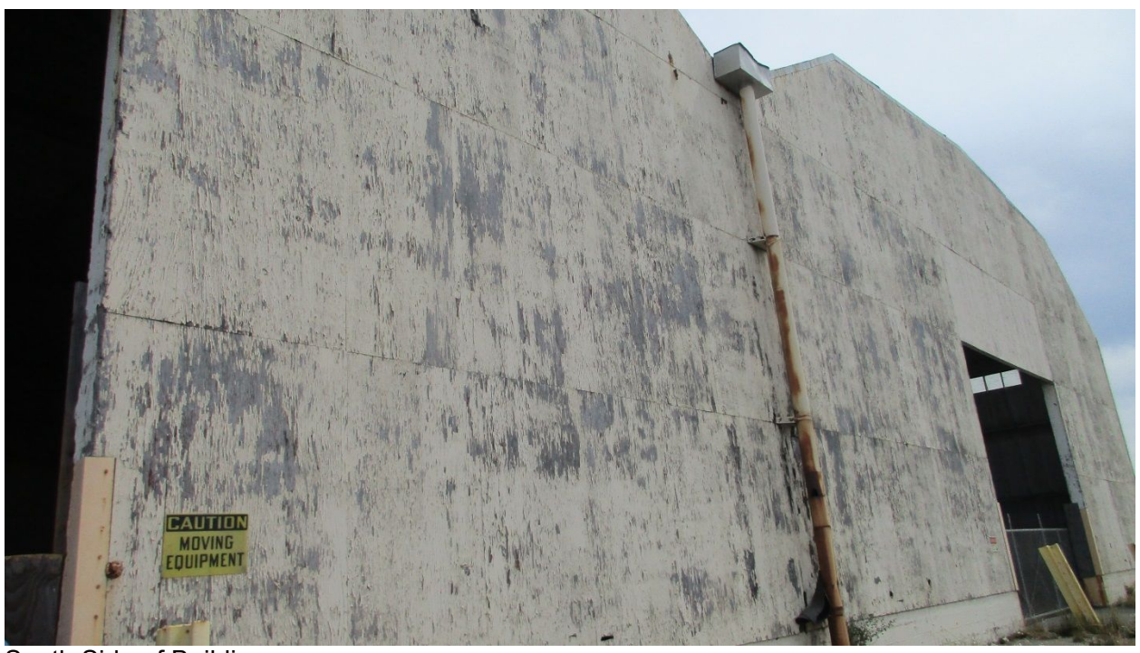
South Side of Building