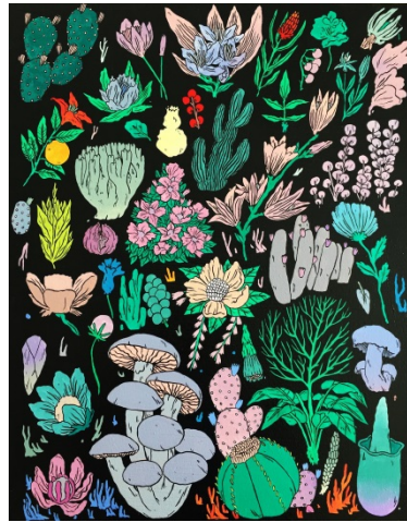
DETH P SUN