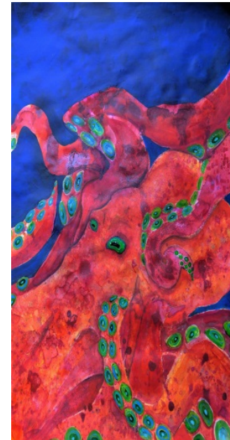
5 SOUL FLOW