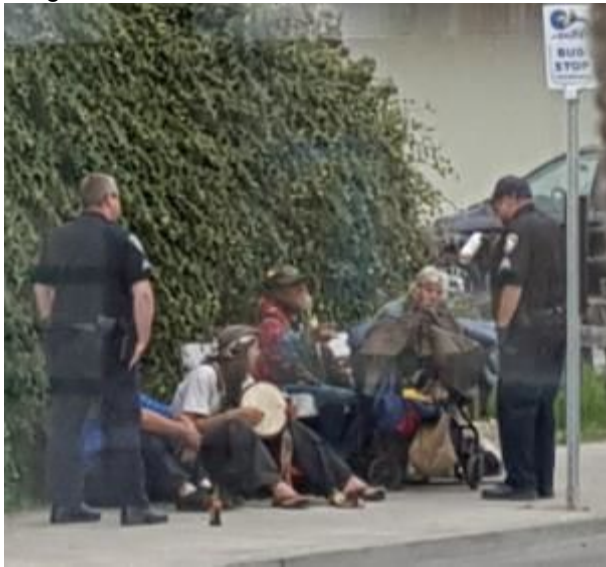
People waiting for HH meals