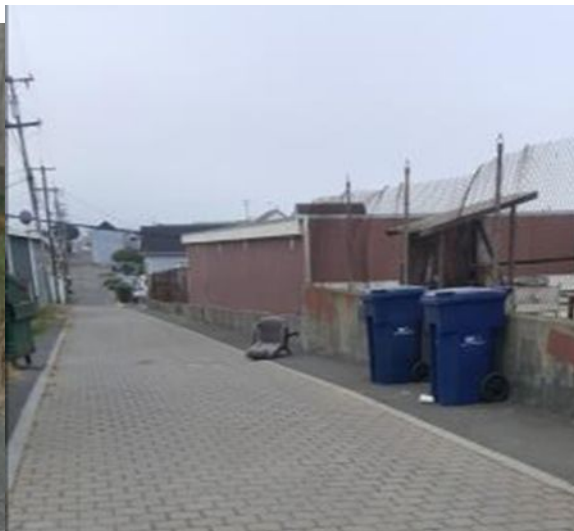
Chair behind HH