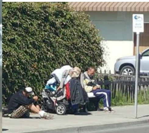
People waiting for HH meals