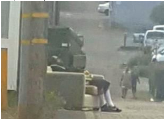
Man sleeping in HH coach in alley