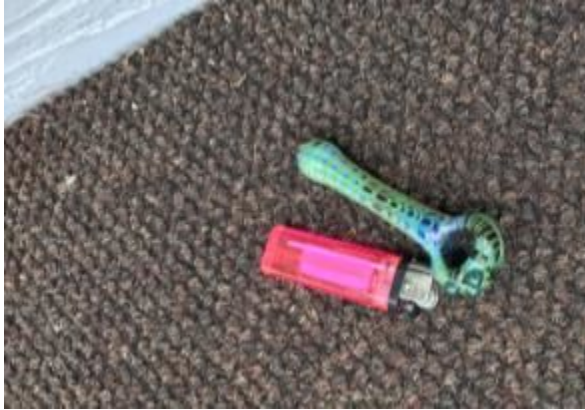
Drugs at HH