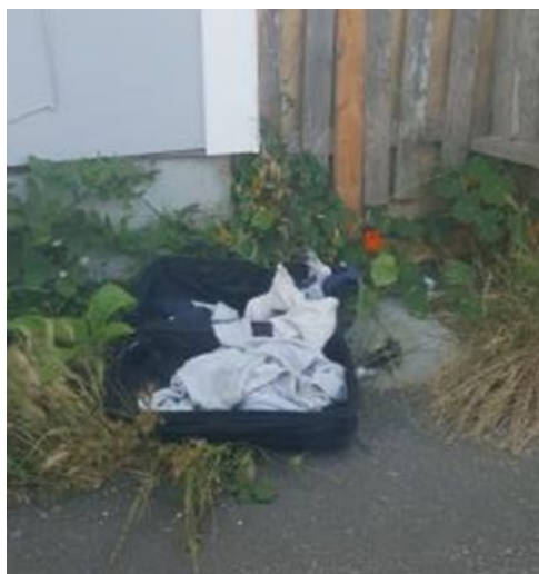
Trash behind HH