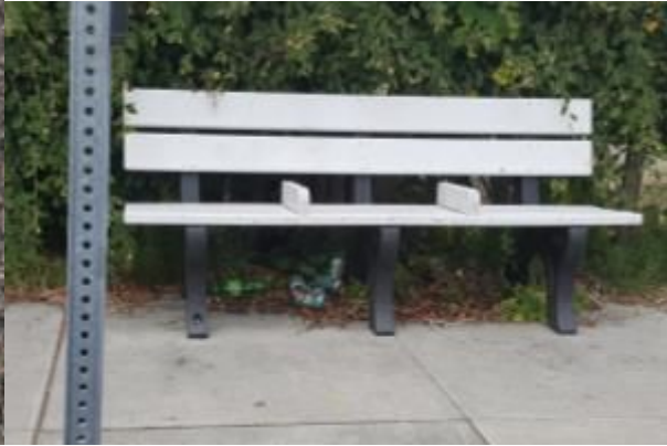
Trash left at bench by HH clients