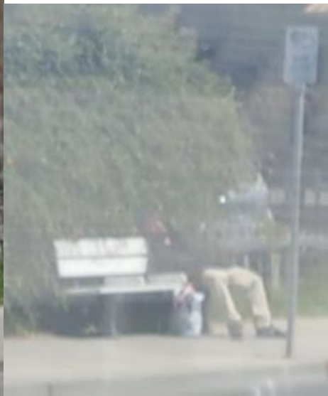
Man sleeping @ bus stop