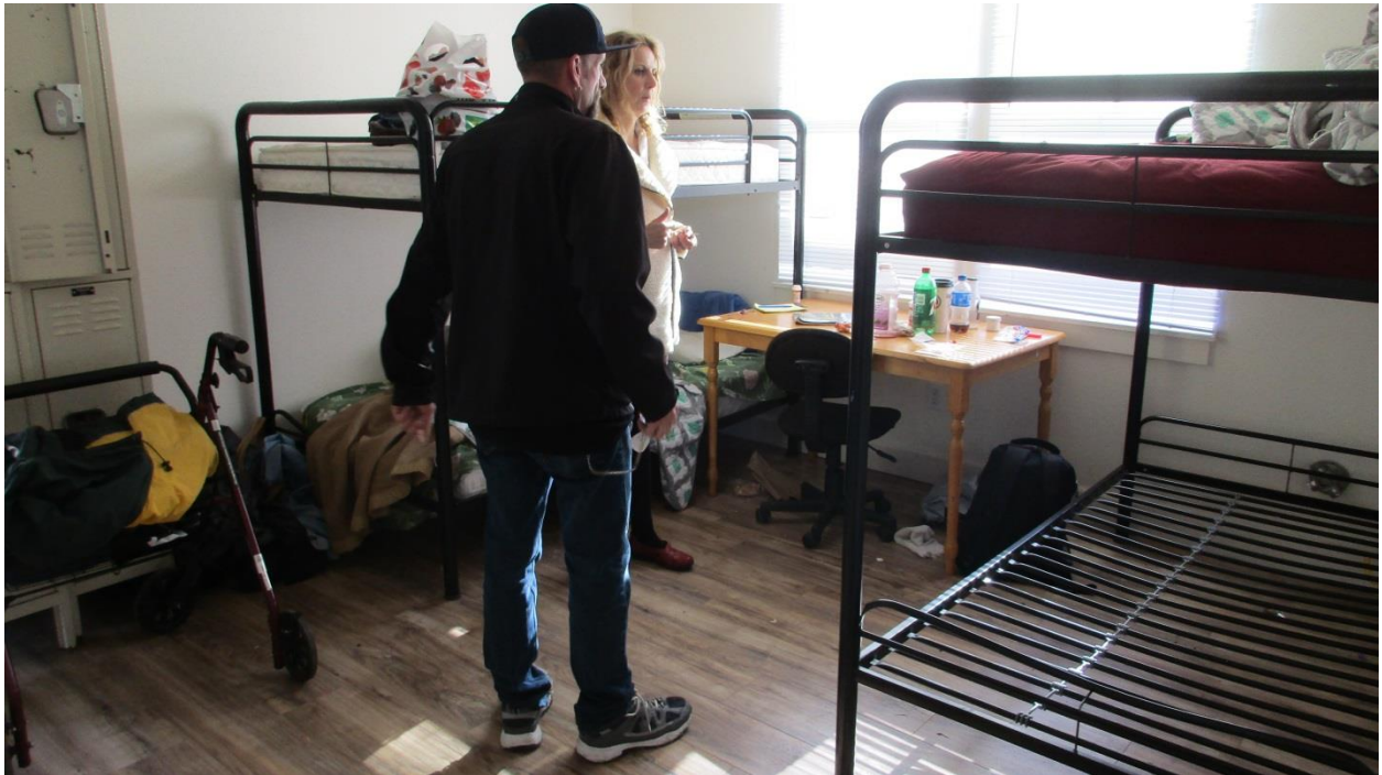
Downstairs – 4 beds