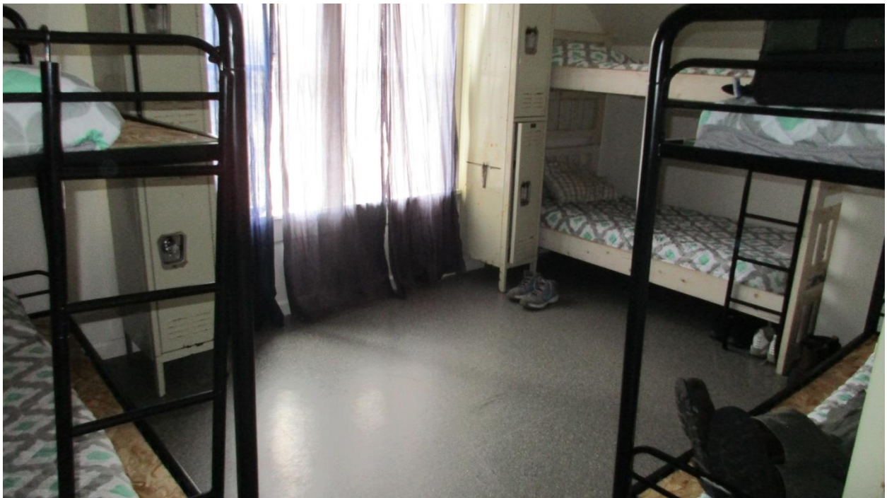
Upstairs Southeast Bedroom (Room 203) – 6 beds