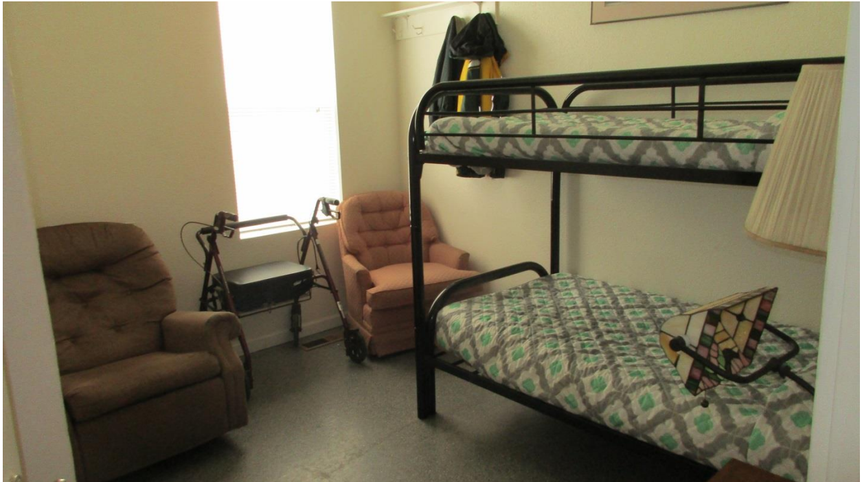
Downstairs ADA room – 2 beds