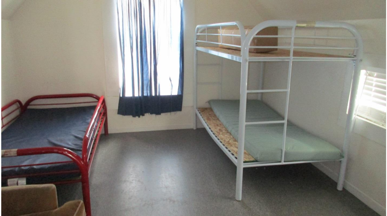
Upstairs Northeast bedroom (Room 204) – 3 beds