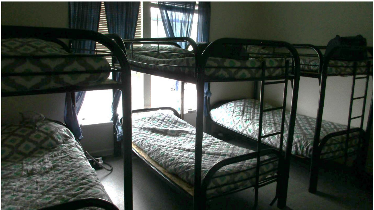
Upstairs Northwest Bedroom (Room 205) – 6 beds