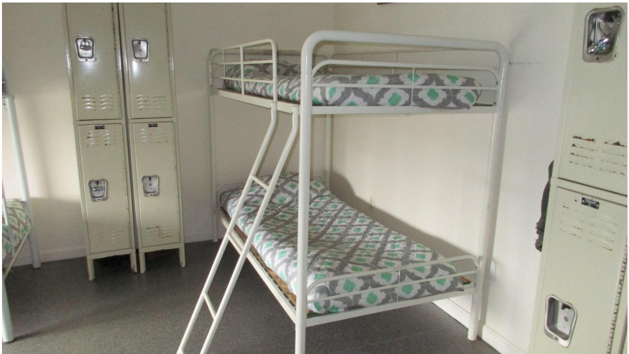
Upstairs South west room (Room 202 on plans) - 8 beds