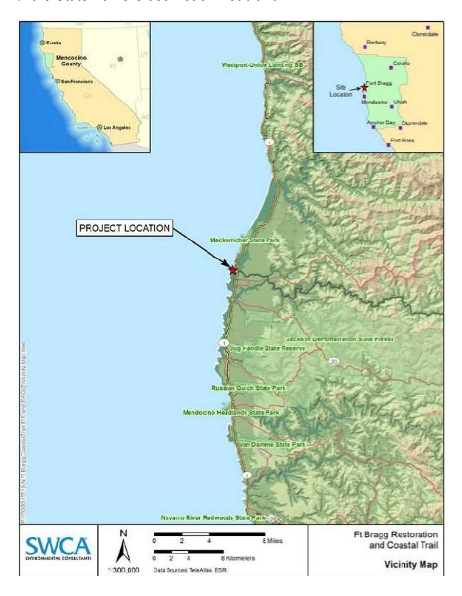
Figure 1. Project Location.

The project is located on the Mendocino Coast, within the city of Fort Bragg (refer to Figure 1). The project site includes 1 parcel. The project parcel is located along the coastline immediately west of the approximately 320-acre (ac) former Georgia-Pacific lumber mill (Mill Site) and south of the State Parks Glass Beach Headland.