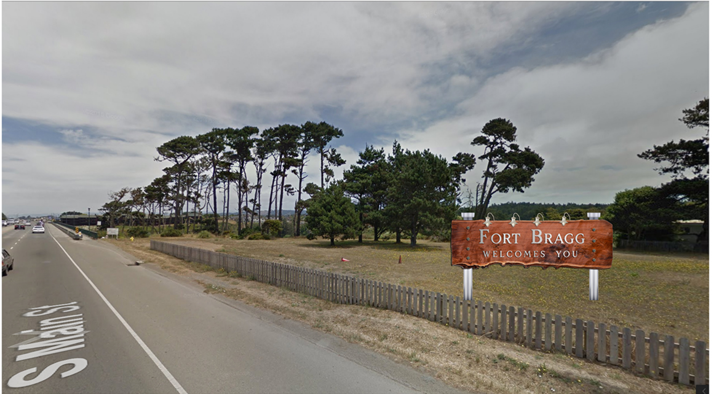
Option 2 design - daylight mockup