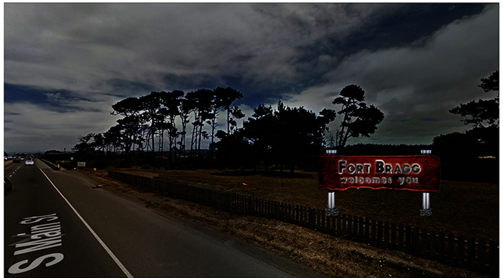
Option I design - evening mockup

Custom Cast Lettering: 1200-V. Clear Anodized Stud Mount-Standard Flat Face Cast-Lexan Halo Backs Inside Cast Bk-Painted White 2 part, Clear Anodized Detachable Studs 60watt LED Power Supply $5000.00