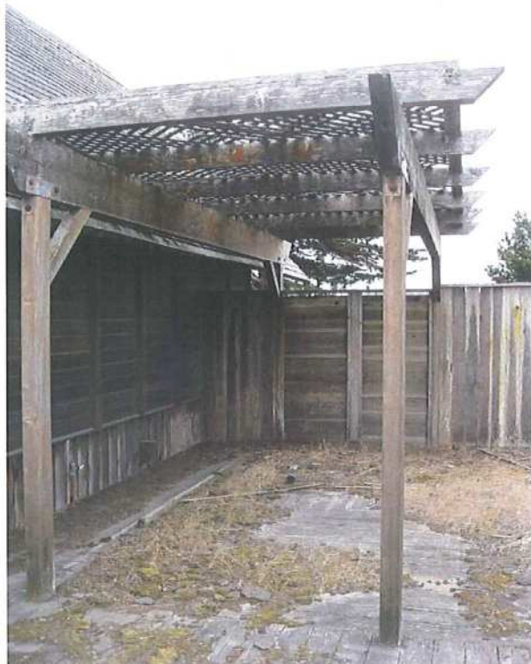
Visitor Center Arbor