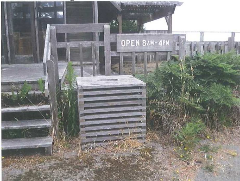
Visitor Center Trash Can