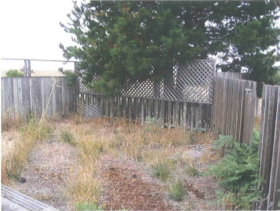
Visitor Center fencing