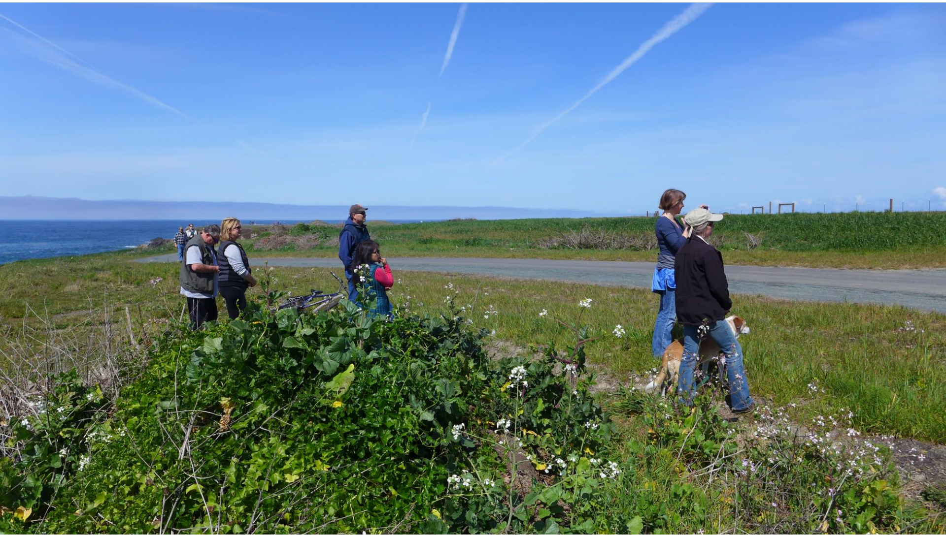
Partial audience, FENCE, Edge Dance Corp.