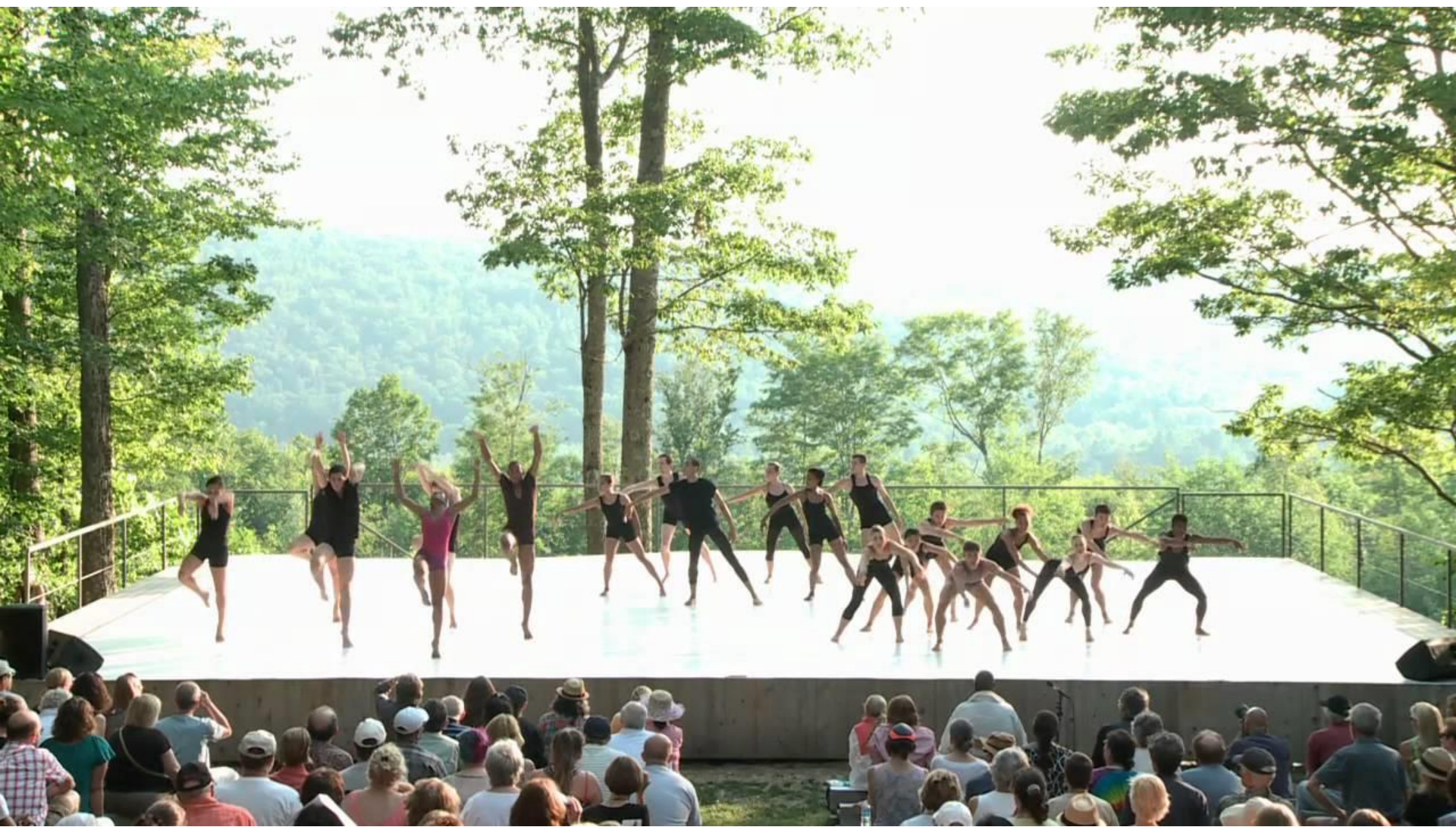
Jacob's Pillow Dance Festival, MA http://www.jacobspillow.org/