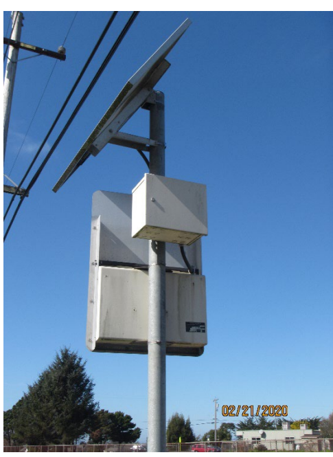
4) South Dana Gray Elementary School, North Calvary Baptist Church, ~290' East of intersection E Chestnut St and S Sanderson Way