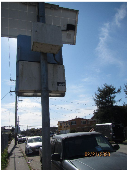
6) South-West Noyo High School, West Vern Piver Field, \sim\!\!350^\circ South intersection Willow St. and S. Sanderson Way