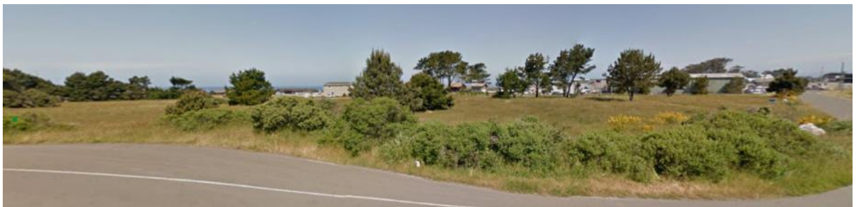
Figure 4: View to horizon from bend in Frontage Road.