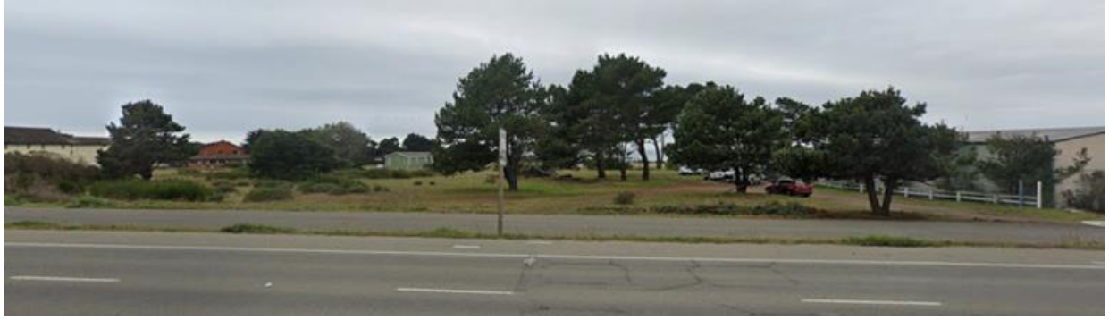
Figure 2 - View to property from Highway 1.