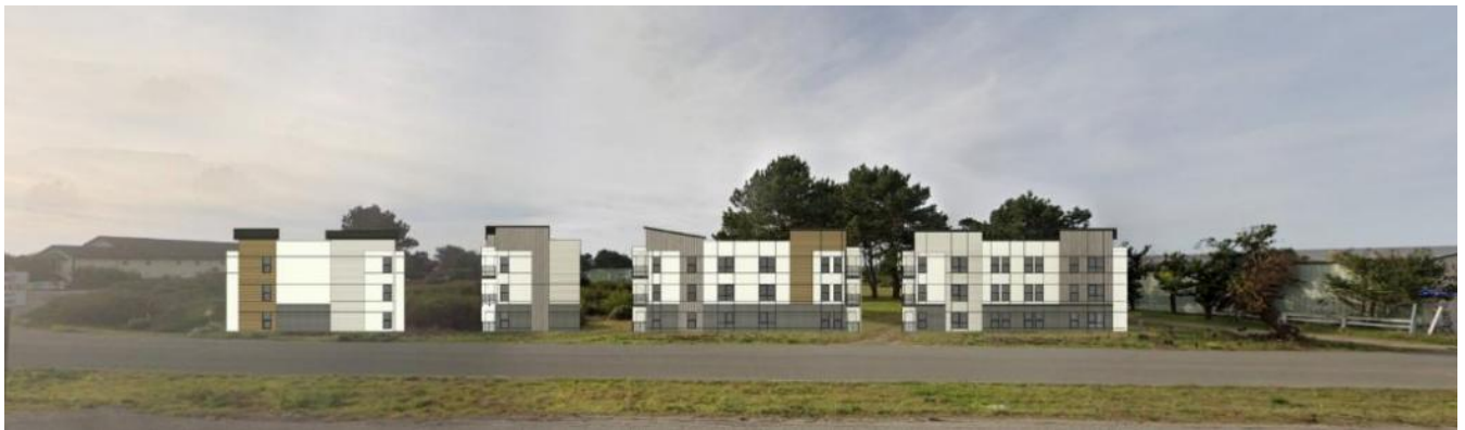
Figure 8: View with Development.

The City's Coastal General Plan does not include a definition of a scenic resource. The California Coastal Act defines scenic resources as the visual and scenic qualities of the coast, including beaches, headlands, bluffs and more. The Act also considers cultural features, historic sites and natural points of interest as scenic resources. The empty field with a few trees does not constitute a scenic resource per this definition of the Coastal Act.