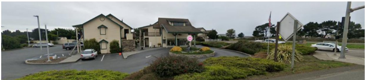
Image 1: Emerald Dolphin Motel Building A (right) and Building B (left)

The building facades facing Highway 1 do not include as many windows or doors as the facades facing south, north and west. This would protect the visual and auditory privacy of future tenants from the noise, headlights, and low-quality views of the highway. The photos below illustrate the design quality of the existing commercial businesses in the area.