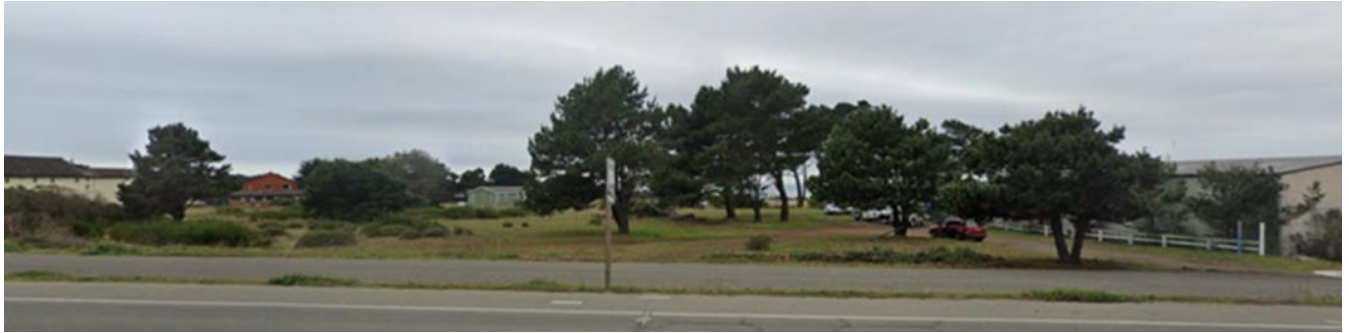
Figure 7: View without Development.