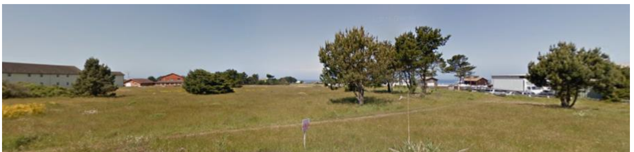
Figure 5: View across middle of site.