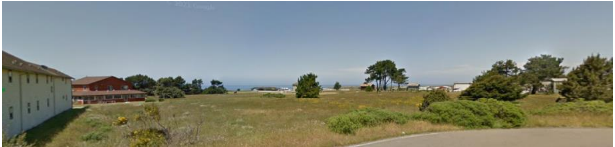
Figure 3: View to horizon from southern edge of property.