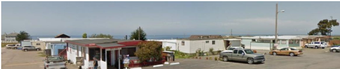
Image 5: Mobile Home Park