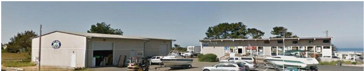
Image 2: Fort Bragg Outlet Building A (right) and Building B (left)