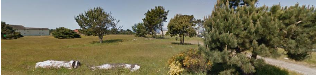
Figure 6: View across the north portion of property.

The Coastal General Plan also includes the following additional visual resource policy: