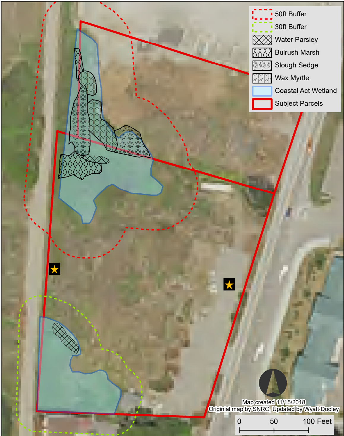
Figure 2 The presumed ESHA map from SNRC's 2015 biological report which reflects the updates provided in SNRC's November 30, 2015 Addendum.