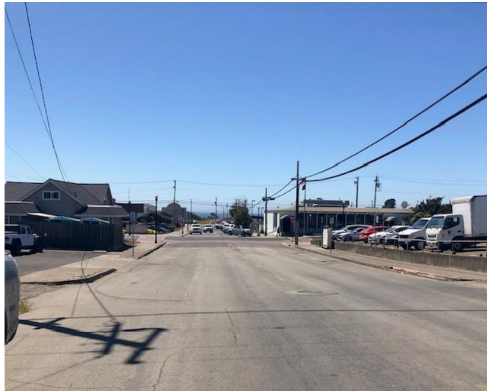
200 Block of Alder Street