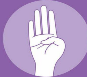
1. Palm to camera and tuck thumb

Use this signal to ask for help on a video call without leaving a digital trace.