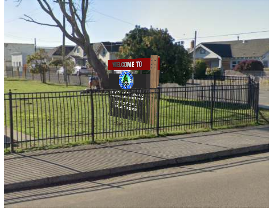
PROPOSED NEW LOOK