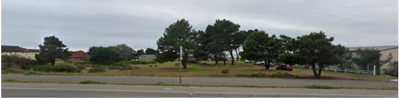
Figure 7: View without Development.