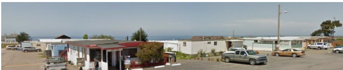
Image 5: Mobile Home Park