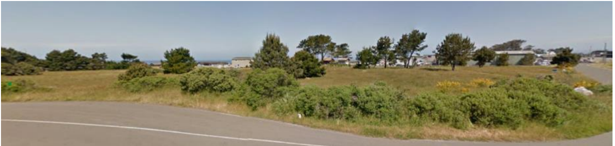
Figure 4: View to horizon from bend in Frontage Road.