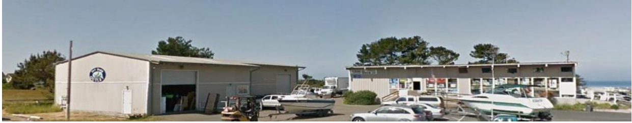
Image 2: Fort Bragg Outlet Building A (right) and Building B (left)