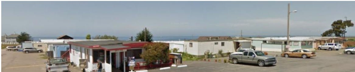
Image 5: Mobile Home Park