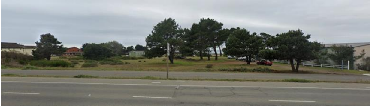
Figure 2 - View to property from Highway 1.