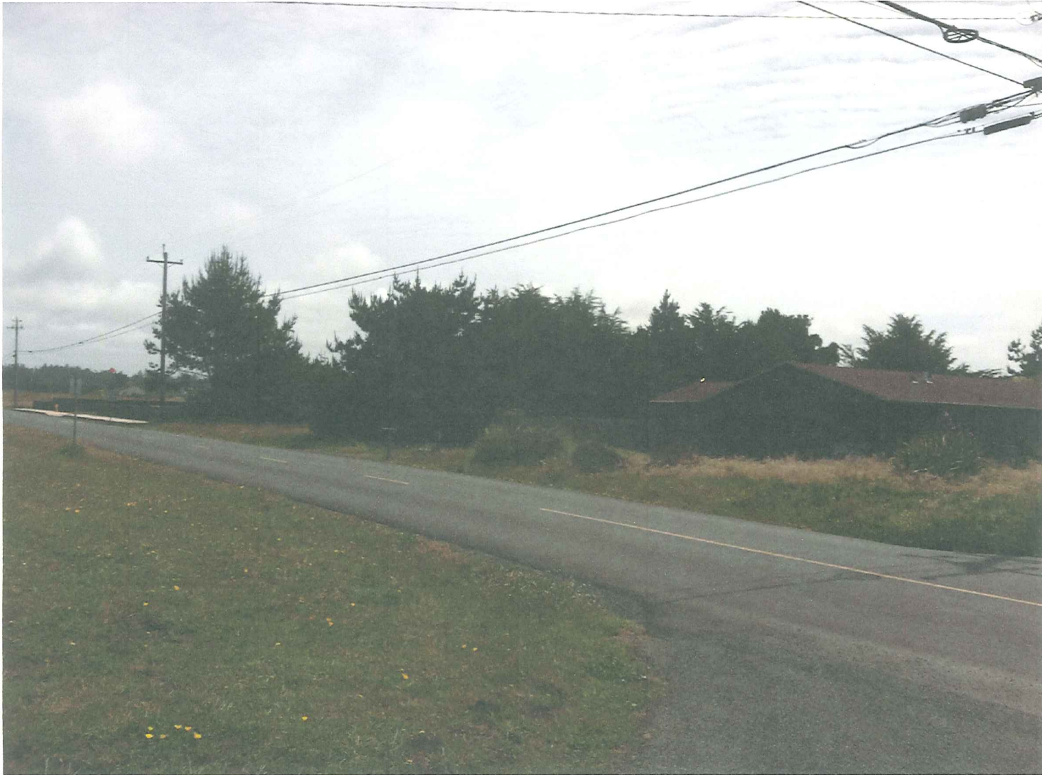
West view - The proposed home is not visible