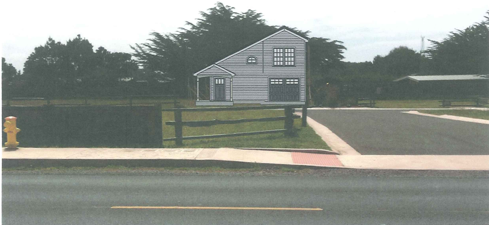
North View - The proposed home is overall height is lower than the existing tree height No obstruction of sky or ocean view