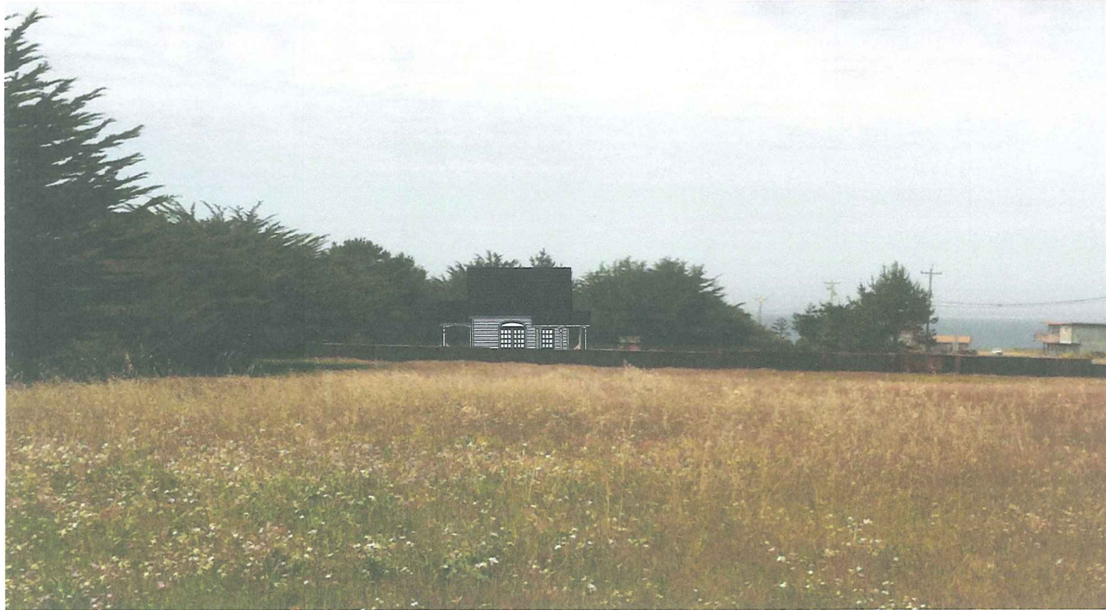
East View - The proposed home is overall height is lower than the existing tree height No obstruction of sky or ocean view

RECEIVED MAY 07 2015 CITY OF FORT BRAGG COMMUNITY DEVELOPMENT DEPT