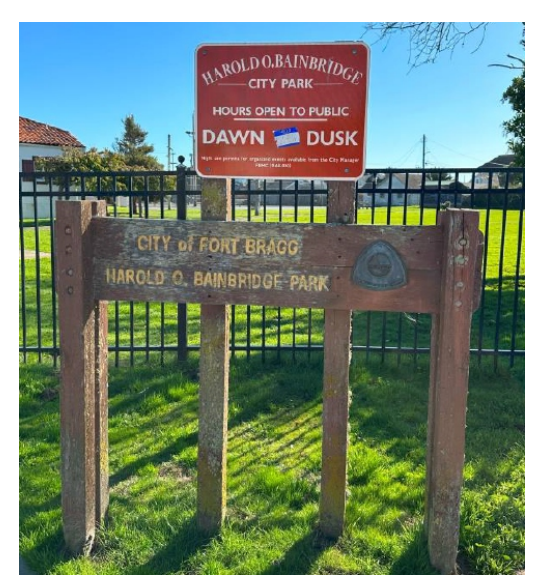
Remove Existing Sign