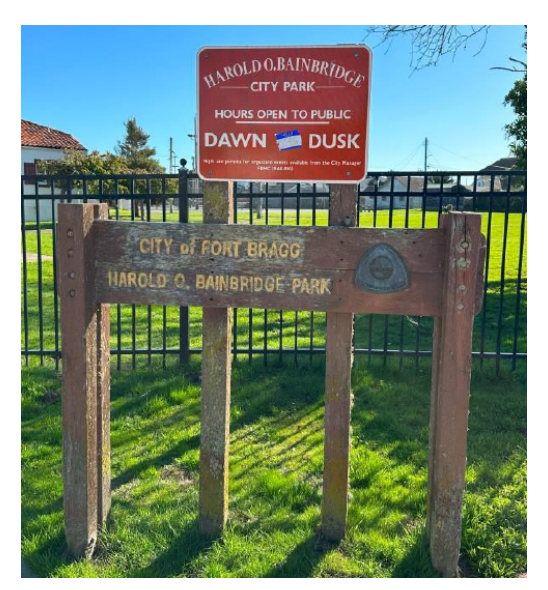
Remove Existing Sign