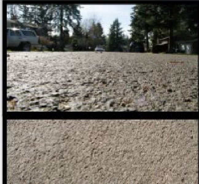
Seven months later ...