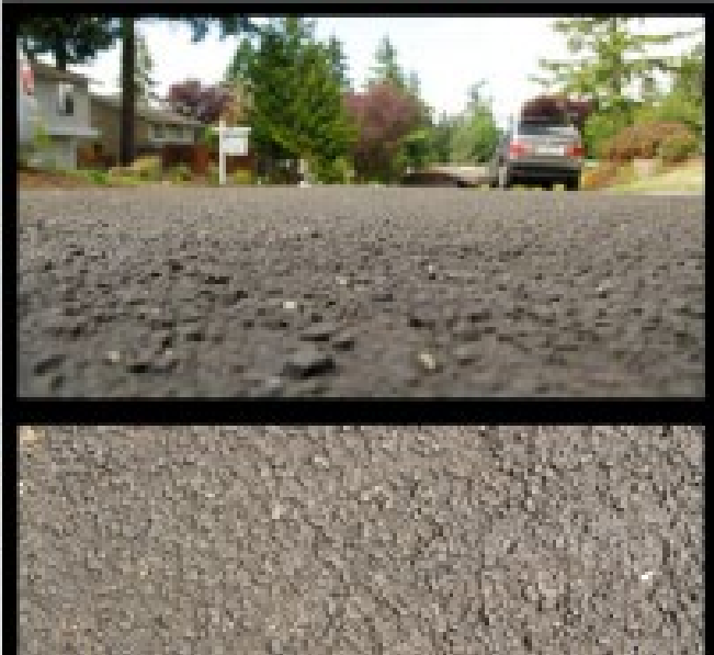
One week later ...