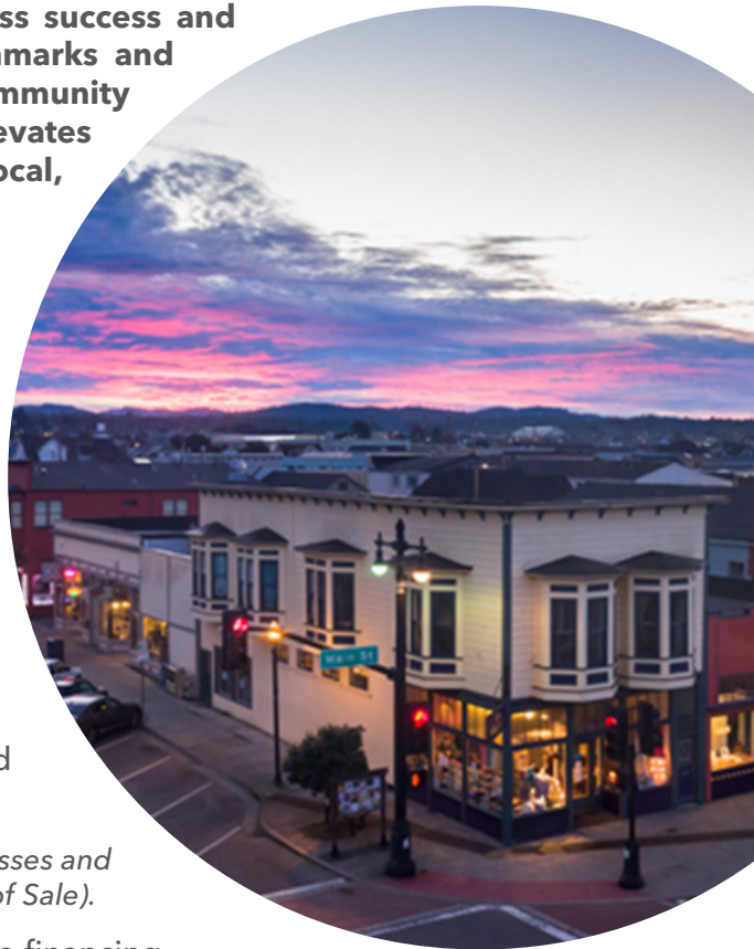
Evening in the heart of Downtown