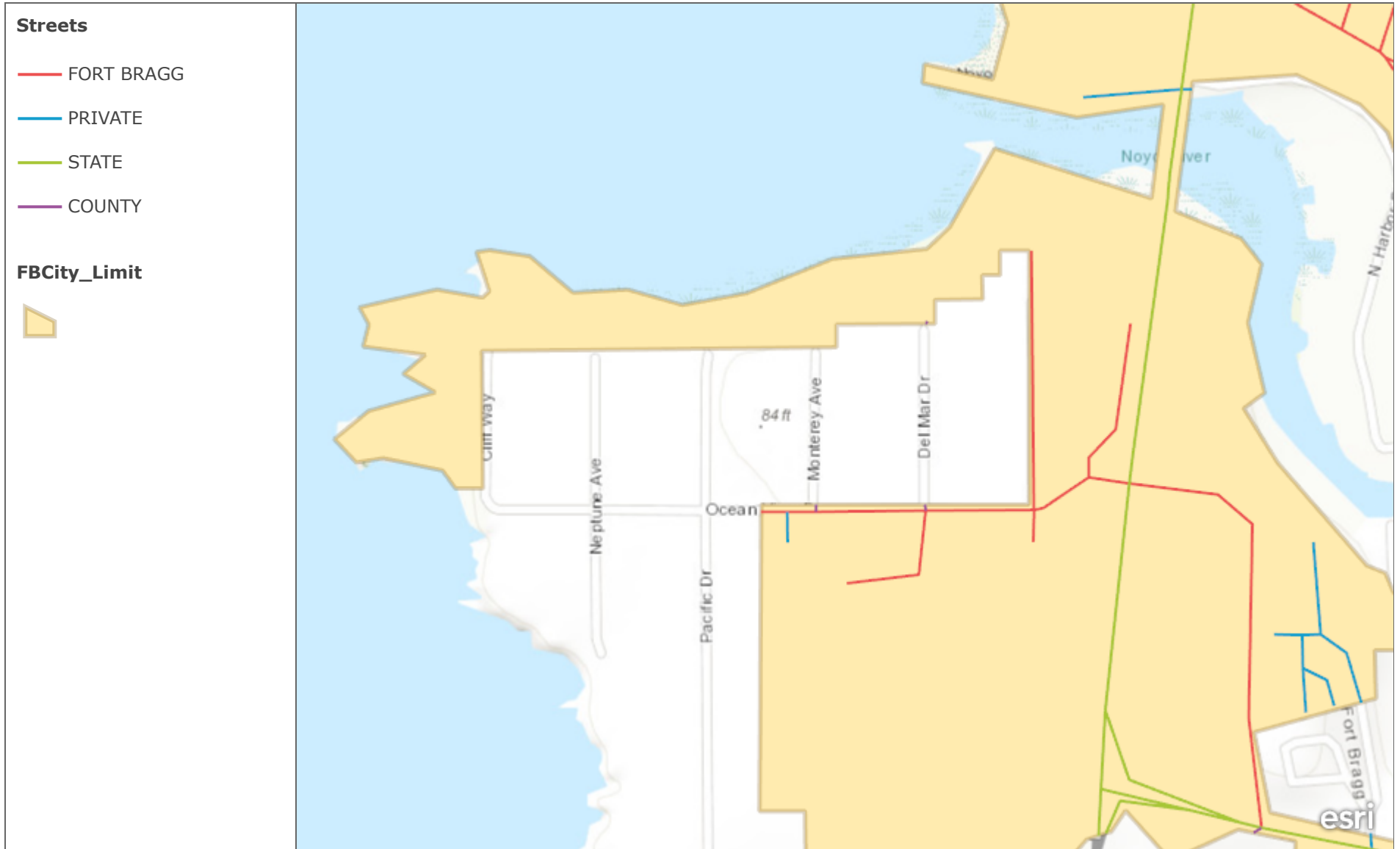
Streets ownership; city limit lines