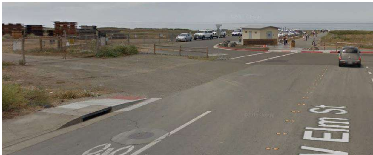
Figure 31: Looking west on Elm Street toward Sea Glass Beach State Park