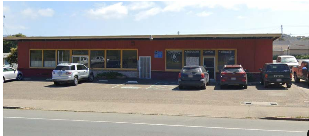
546 S. Main St.