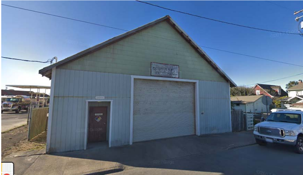
120 E Bush