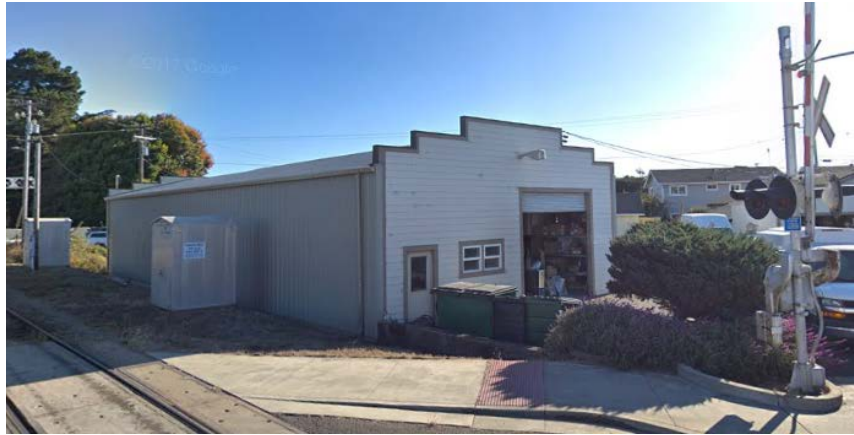
220 E. Bush