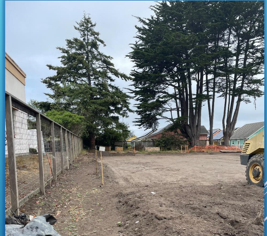
Location of first home