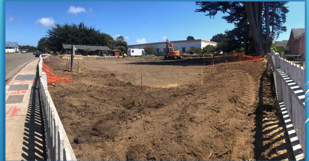
Site Preparation Activities