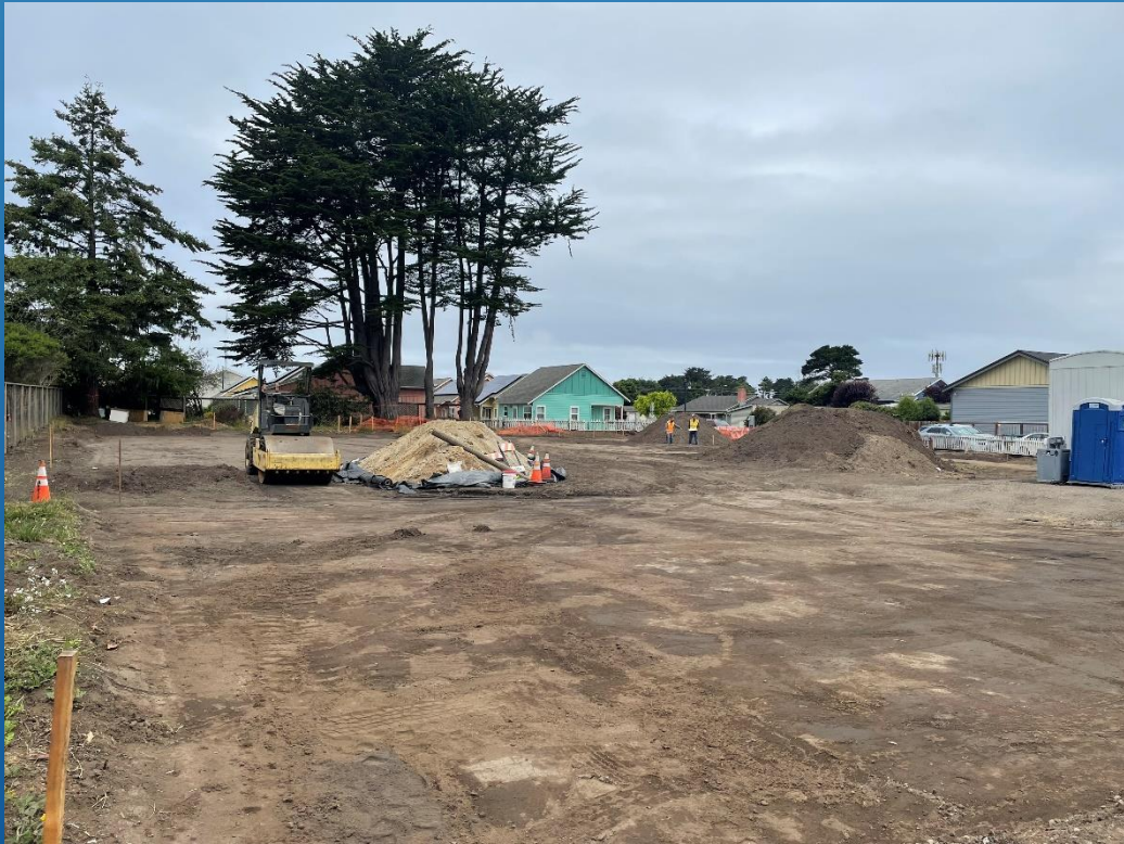
Preparing to Stake for slab