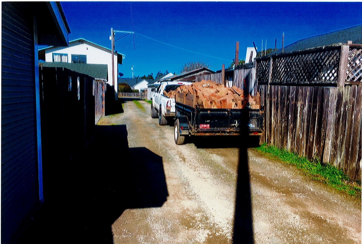
Pickup & Trailer parked behind 149 N. Lincoln St while the propane delivery above was taking place. Fortunately the truck & trailer left while the propane delivery was finishing up. If it had not the truck would have had to back up on to Oak St.