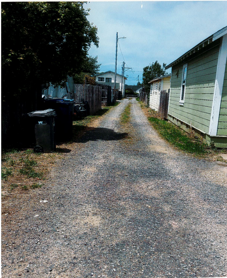
117 N. Lincoln St. (15 feet wide)