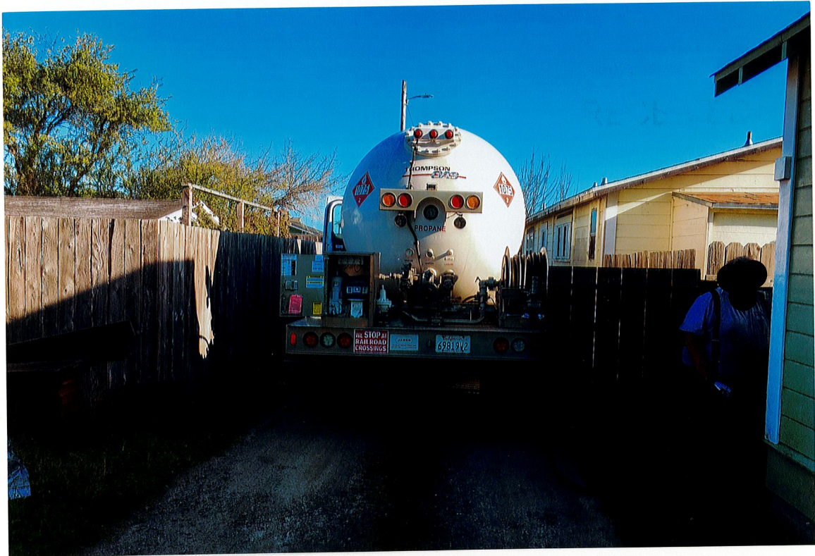
Propane Delivery by Thompson Gas to 117 N. Lincoln St. @ 9:05 a.m. on March 30th, 2021