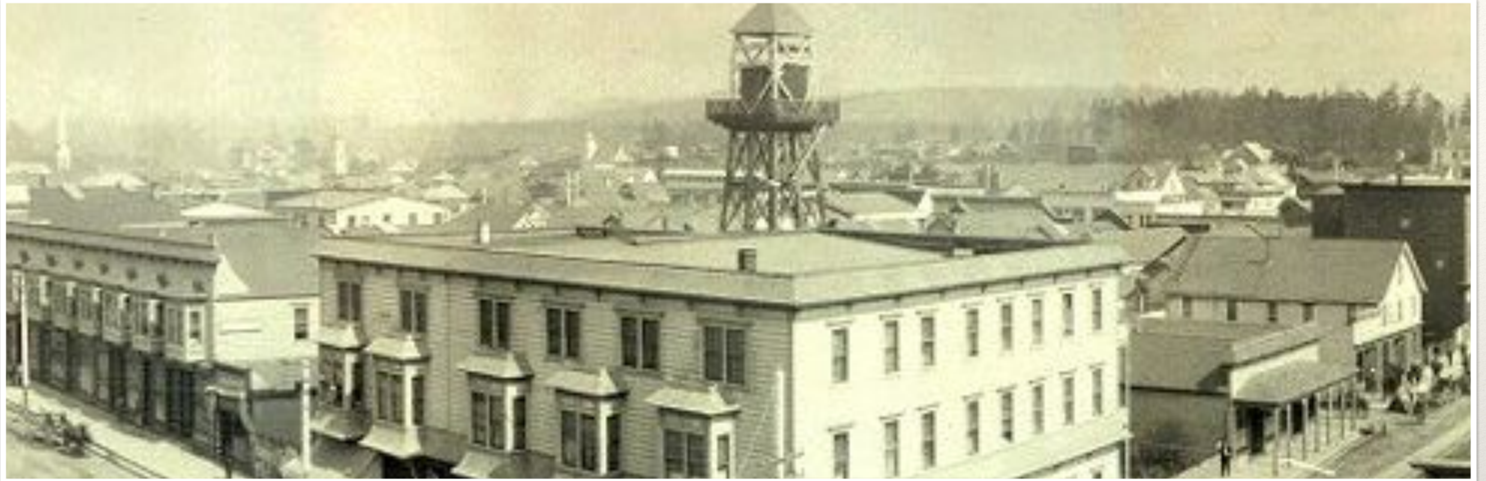
Fort Bragg, Ca