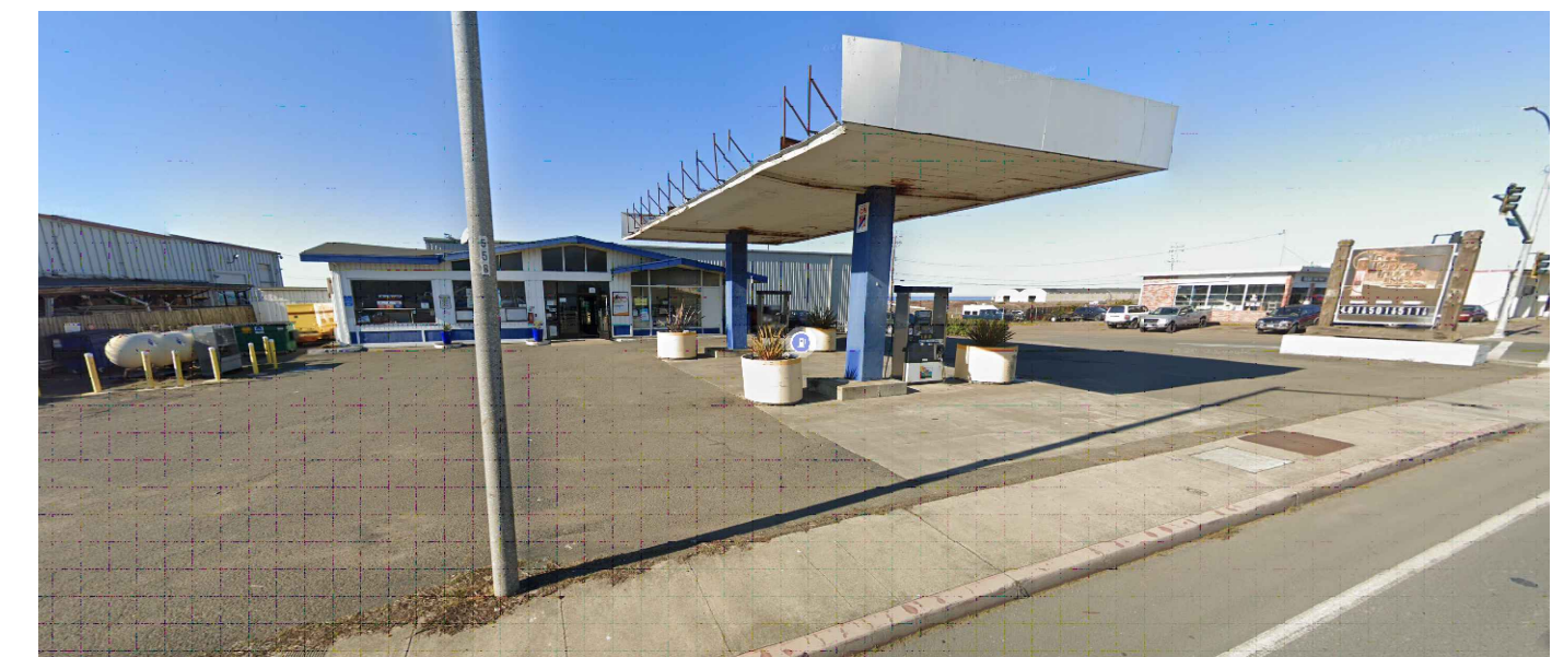
EXISTING SITE PICTURE