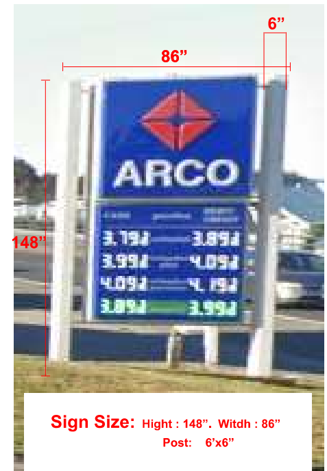
Existing Sign - E

Sign Size: Hight : 148". Withd : 86" Post: 6'x6"