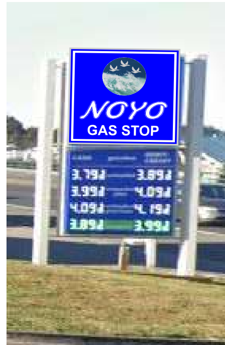
Enhanced Sign - E