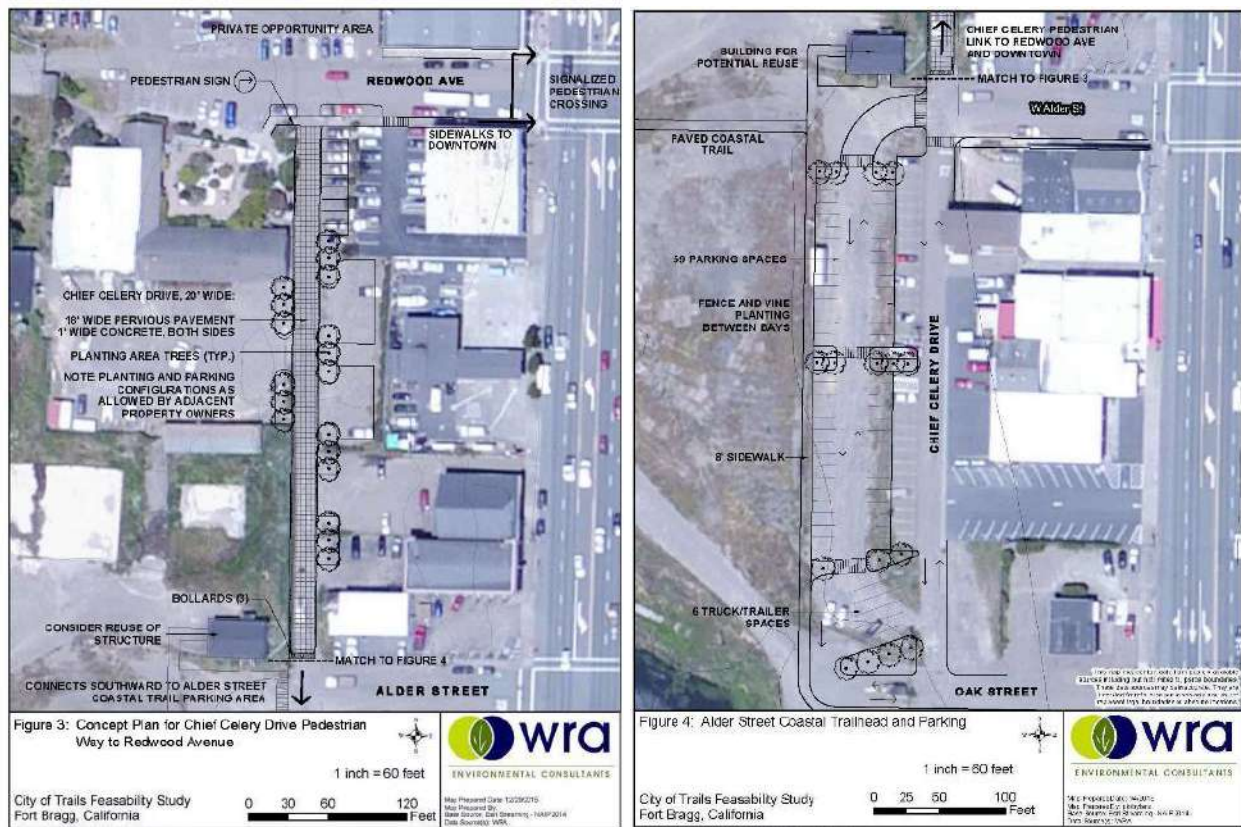
Figure 34: Redwood Avenue - Coastal Trail Linkage Plan