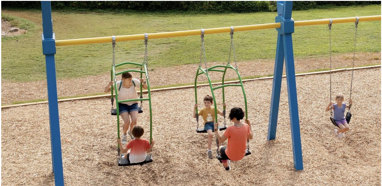
Figure 2: Tandem Expression Swings