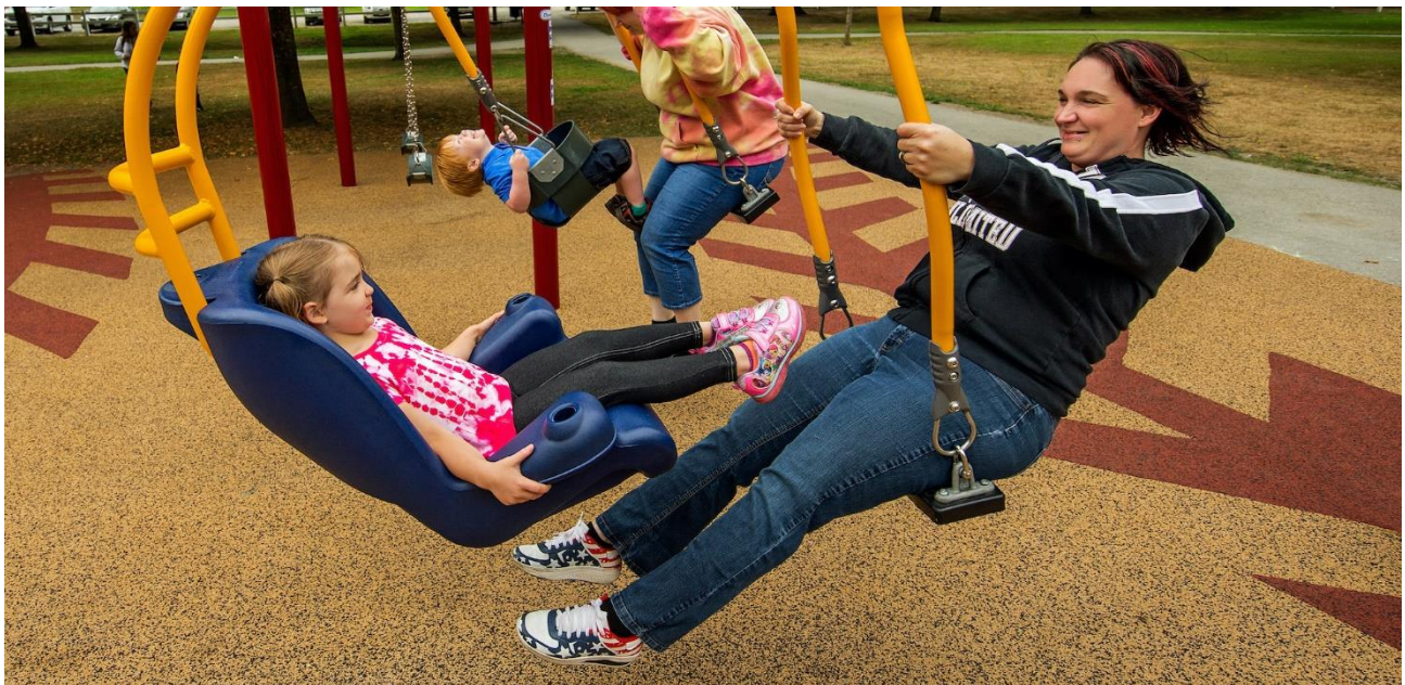
Figure 3 Adaptive Expression Swings