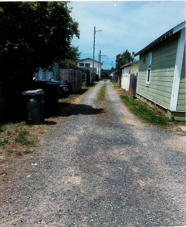
117 N. Lincoln St. (15 feet wide)