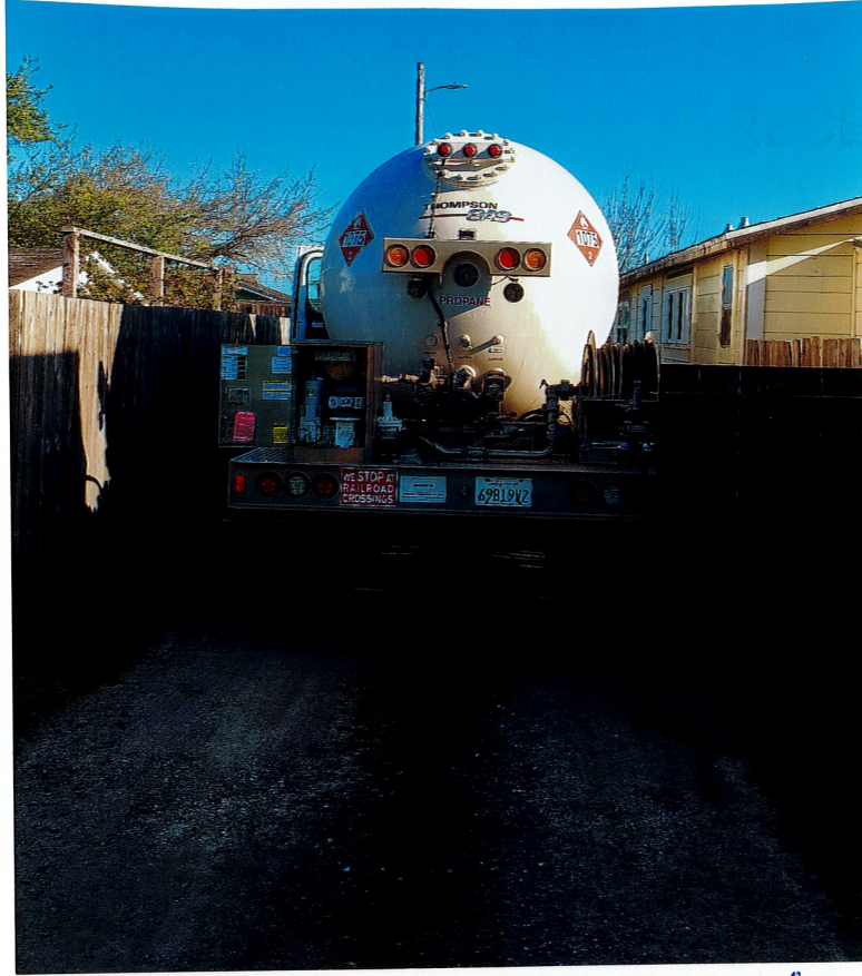
Propane delivery to 117 N. Lincoln St.