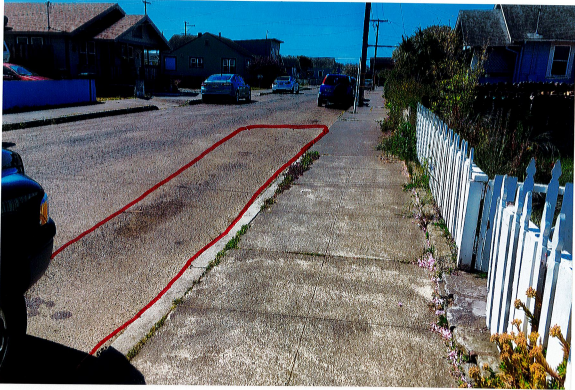
Looking South toward Oak St.

PARKING AVAILABLE on N. Lincoln @ 149 N. Lincoln St.