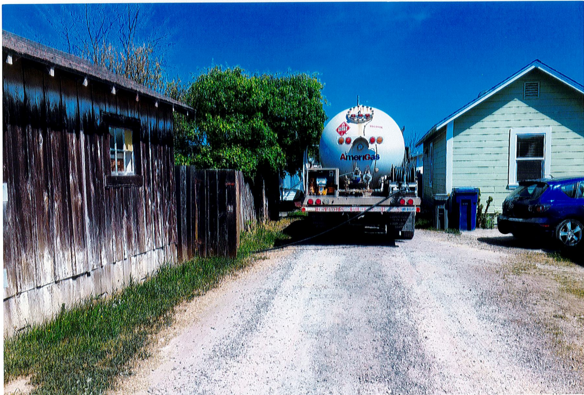
Propane delivery To 112 Morrow St.