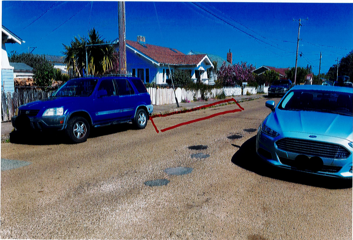
Looking North toward Alder St.