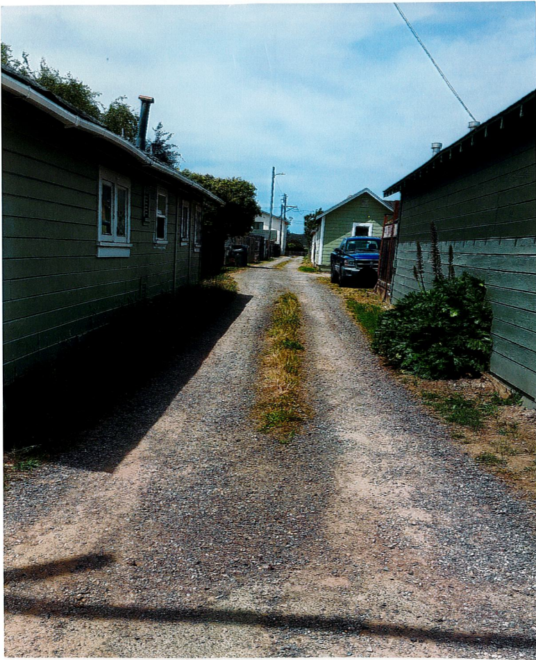
Oak Street (15 feet wide)