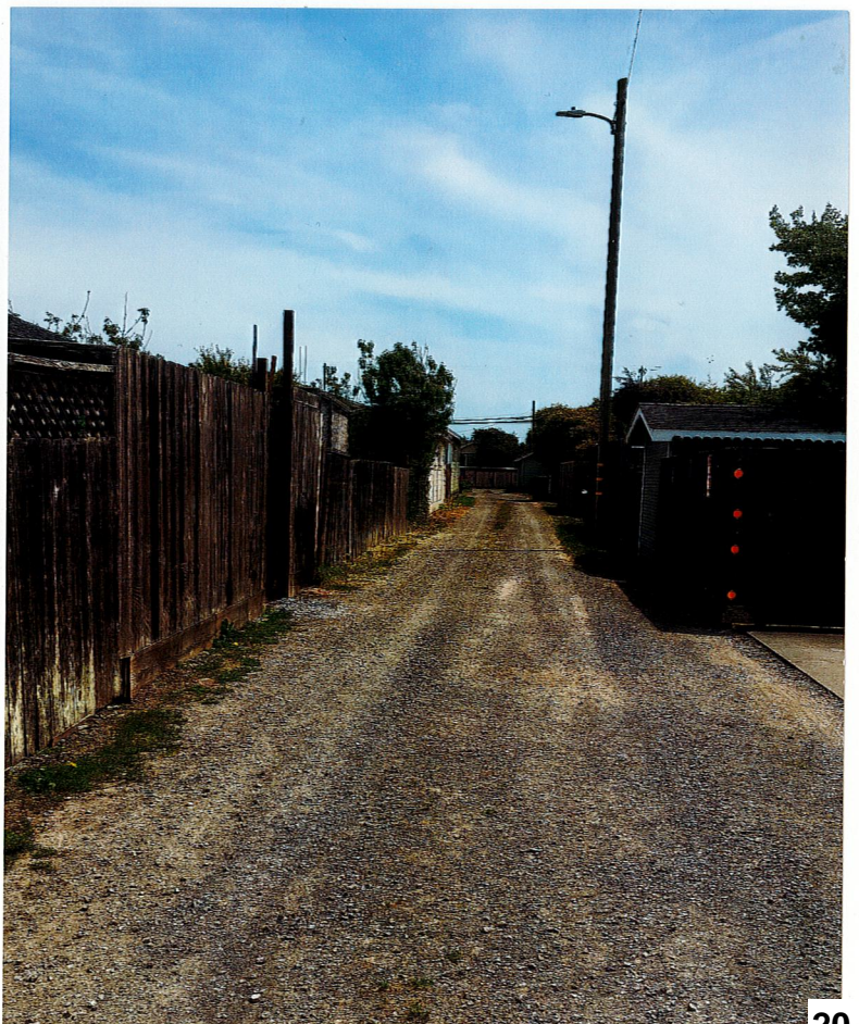
149 N. Lincoln St. (14 ft. wide)