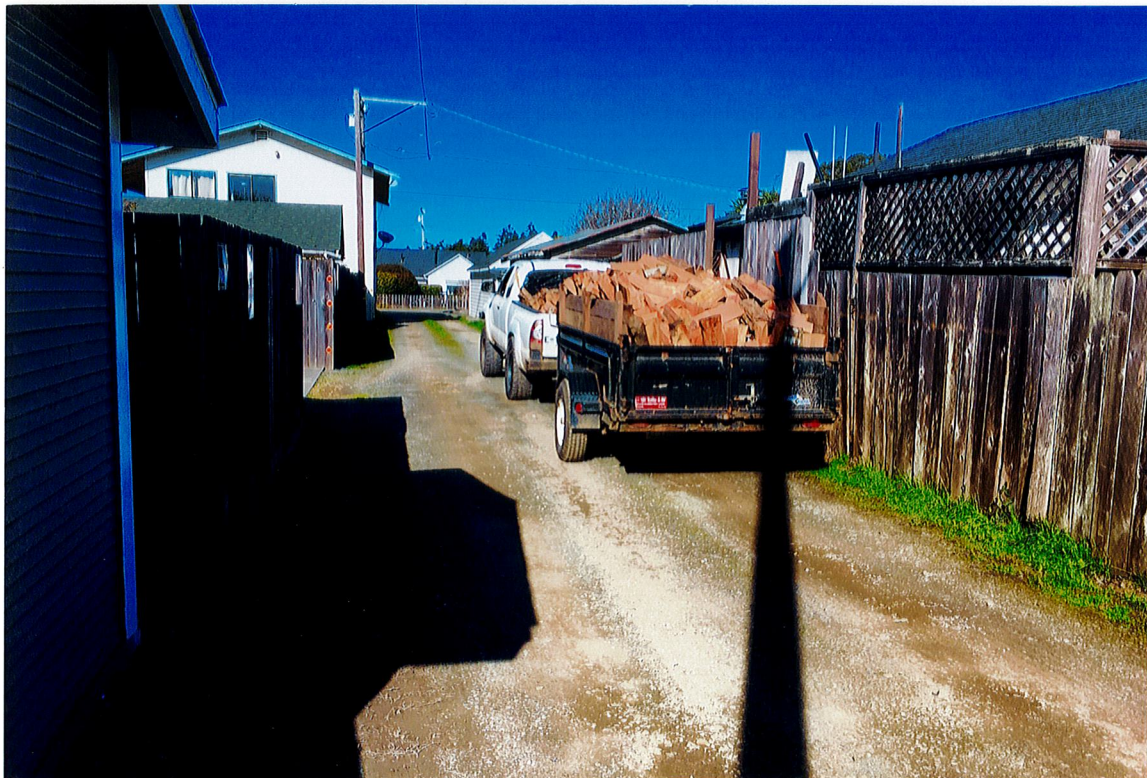
Pickup & Trailer parked behind 149 N. Lincoln St while the propane delivery above was taking place. Fortunately the truck & trailer left while the propane delivery was finishing up. If it had not the truck would have had to back up on to Oak St.