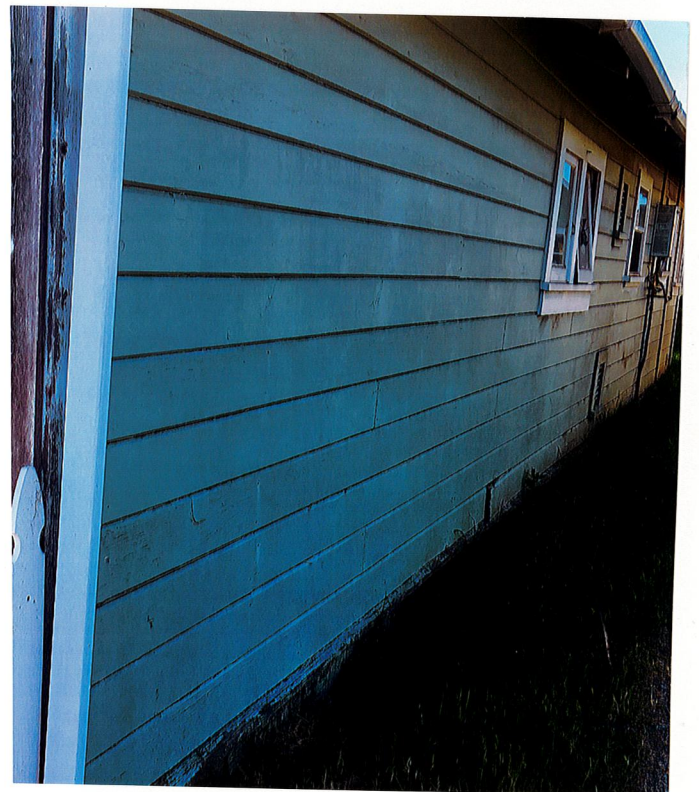
Oak St. @ Alley