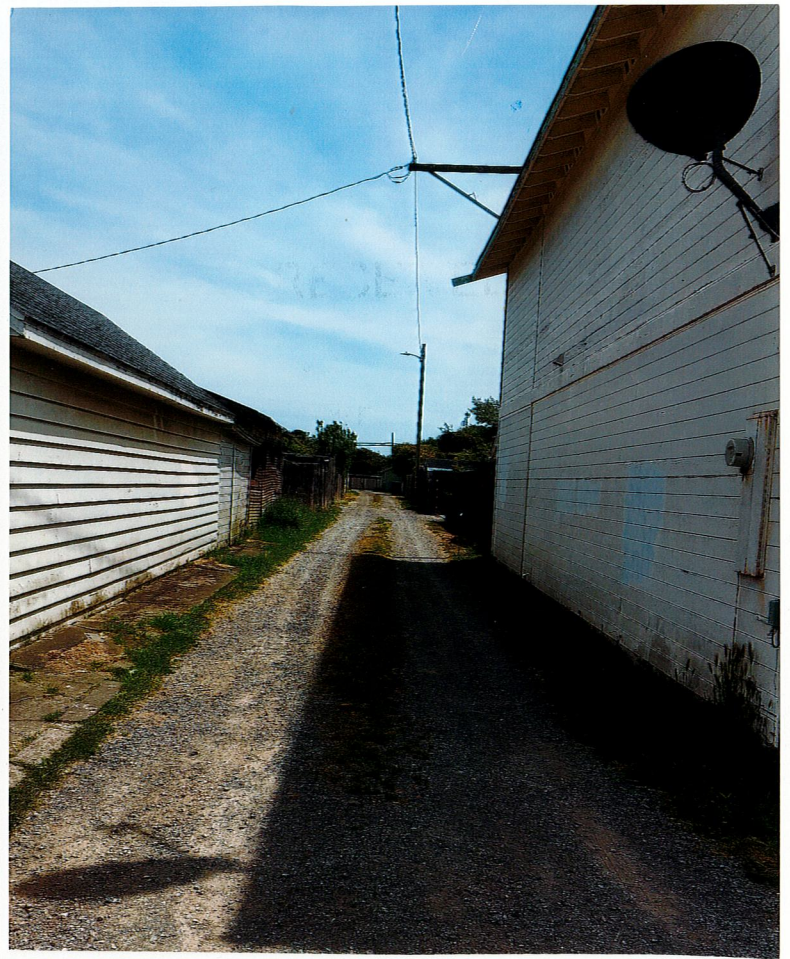
Alder Street (13 feet wide)