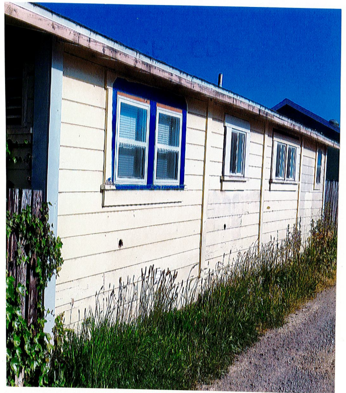
127 N. Lincoln St.