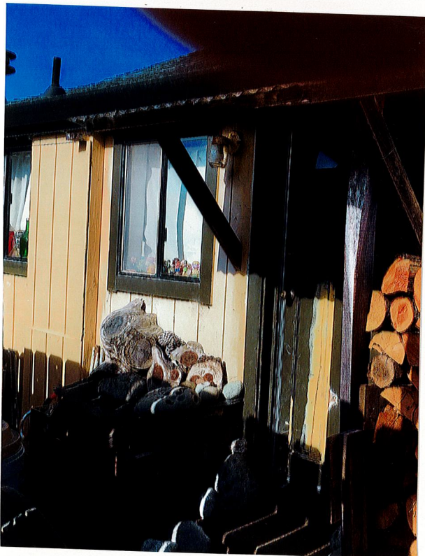
149 N. Lincoln St.