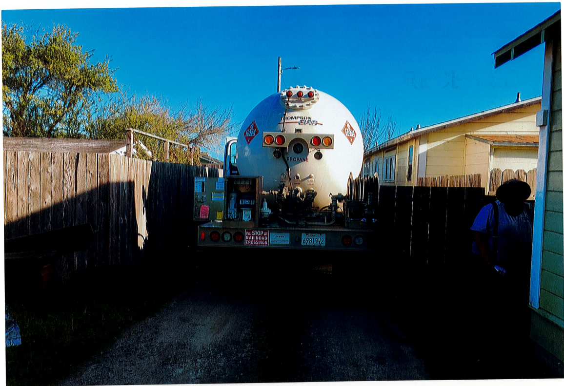
Propane Delivery by Thompson Gas to 117 N. Lincoln St. @ 9:05 a.m. on March 30th, 2021