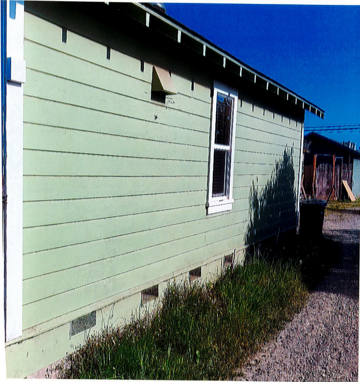
117 N. Lincoln St.